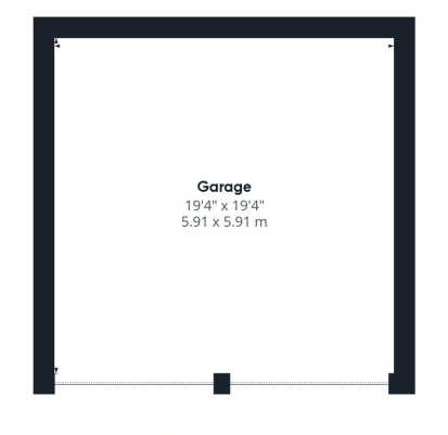
Floor 1 Building 2