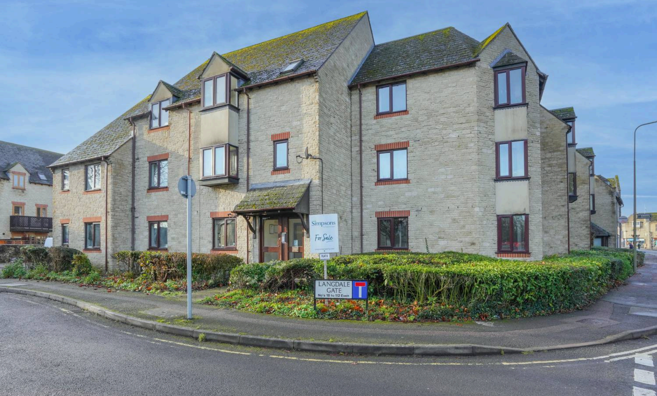
Flat 8, Evenlode Court, 18 Langdale Gate