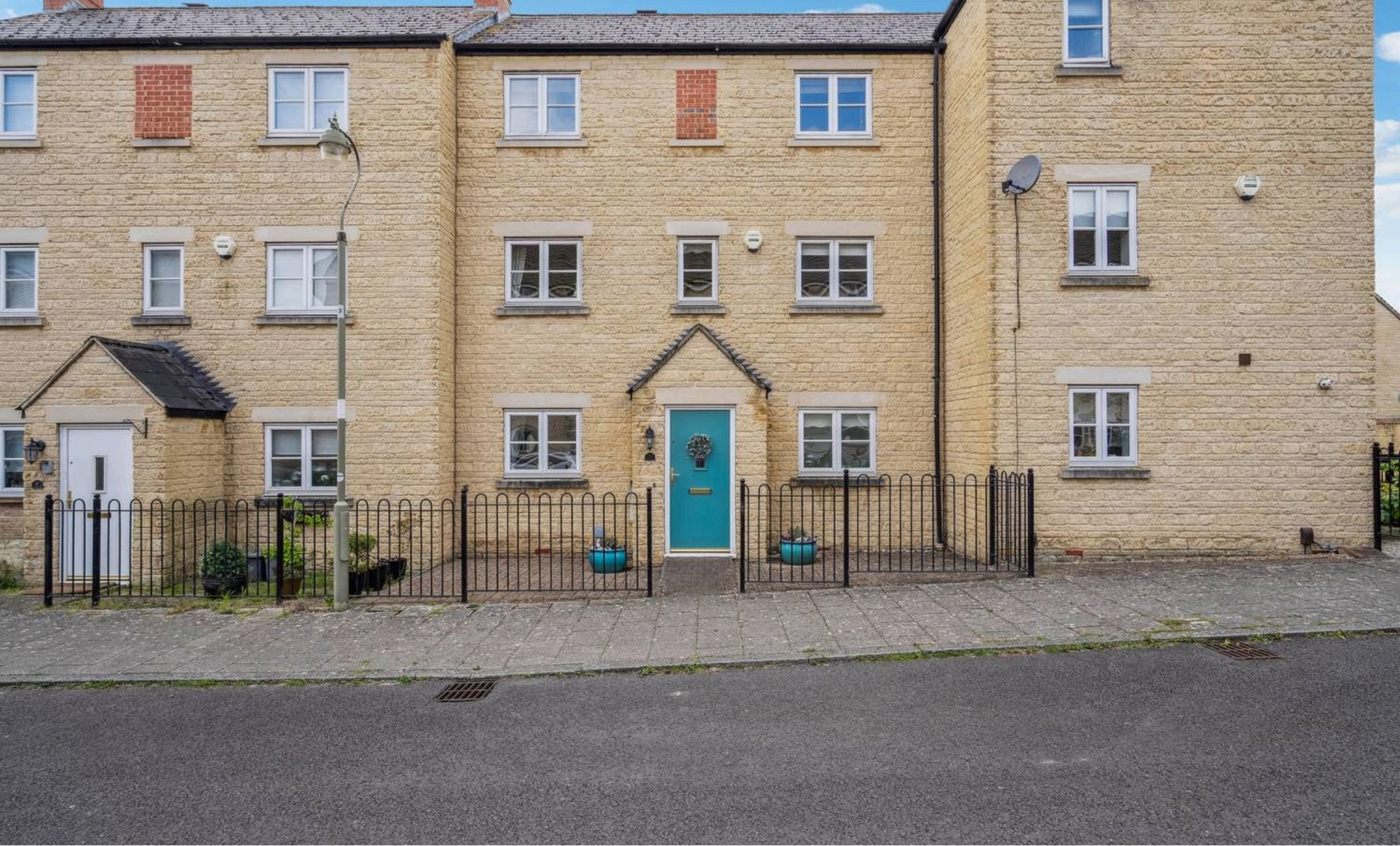
7 Oakmead, Witney