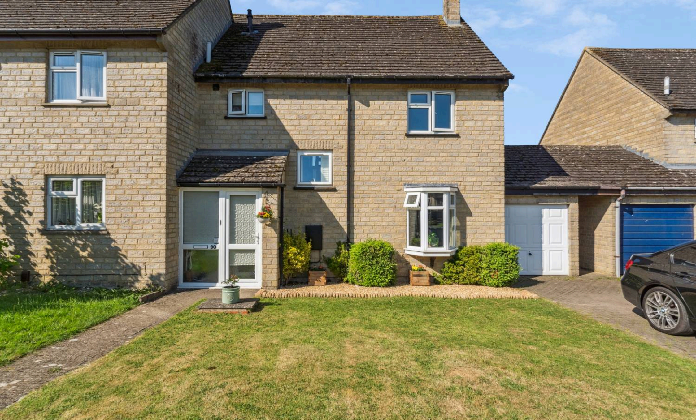
90 Blakes Avenue, Witney