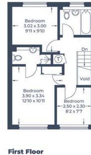
Illustration for identification purposes only, measurements are approximate, not to scale. © CJ Property Marketing Produced for Simpsons