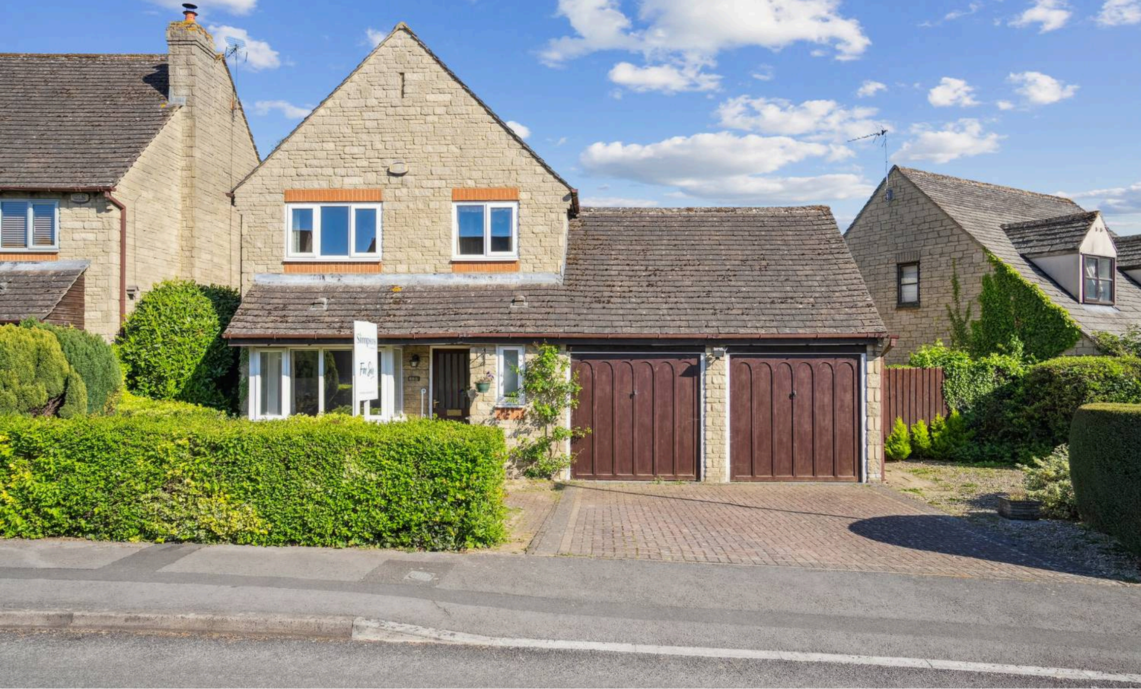
103 Raleigh Crescent, Witney