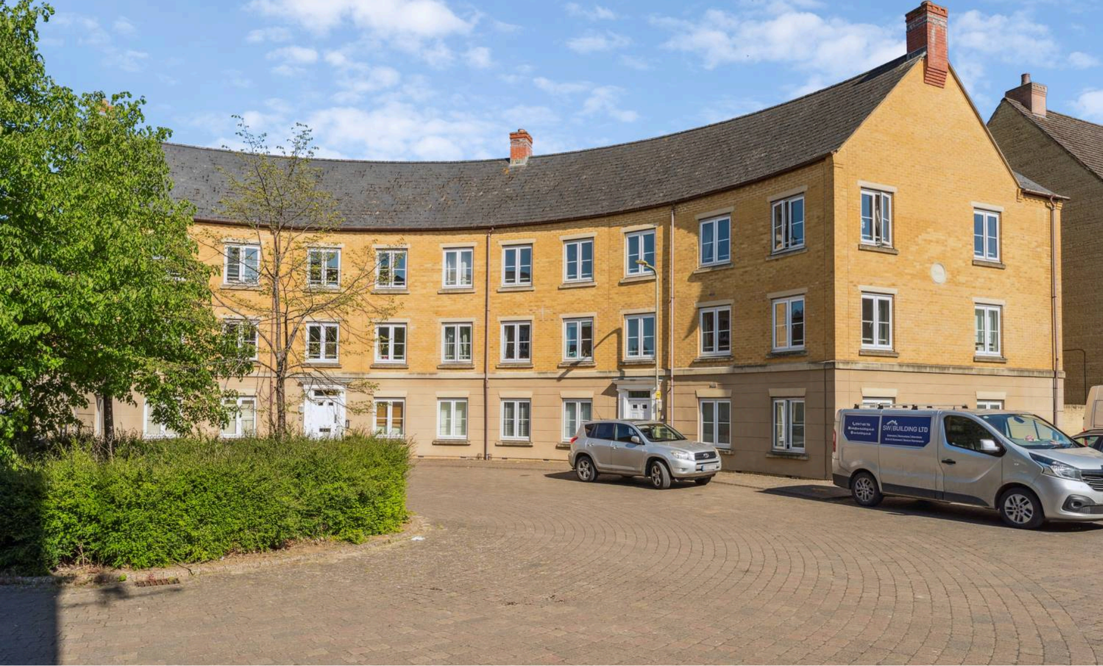
33 New Bridge Street, Witney