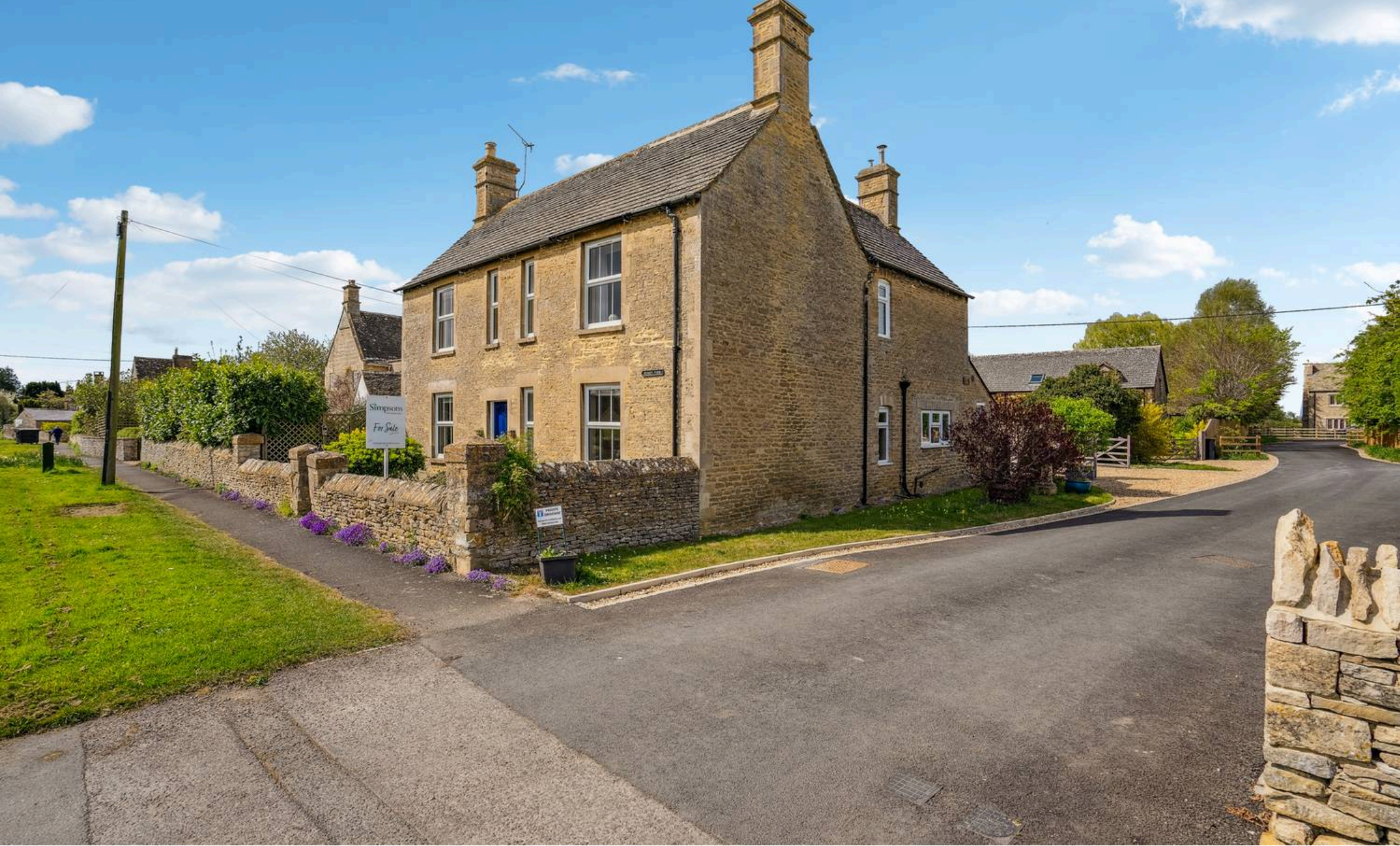
Bushey Farm Main Street, Clanfield