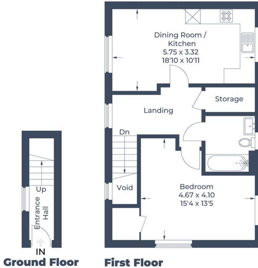
Illustration for identification purposes only, measurements are approximate, not to scale. © CJ Property Marketing Produced for Simpsons