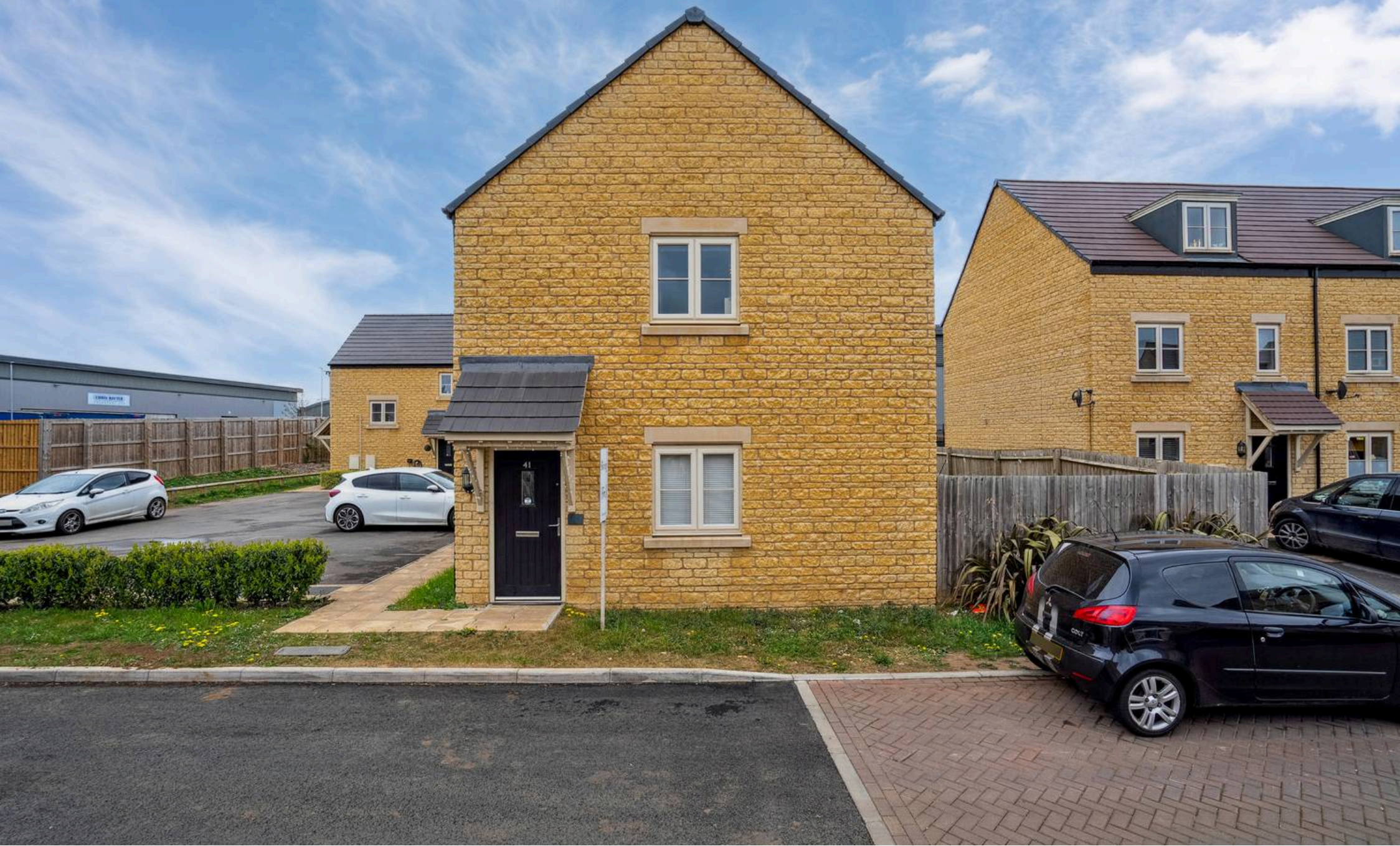
41 Mary Ellis Way, Witney