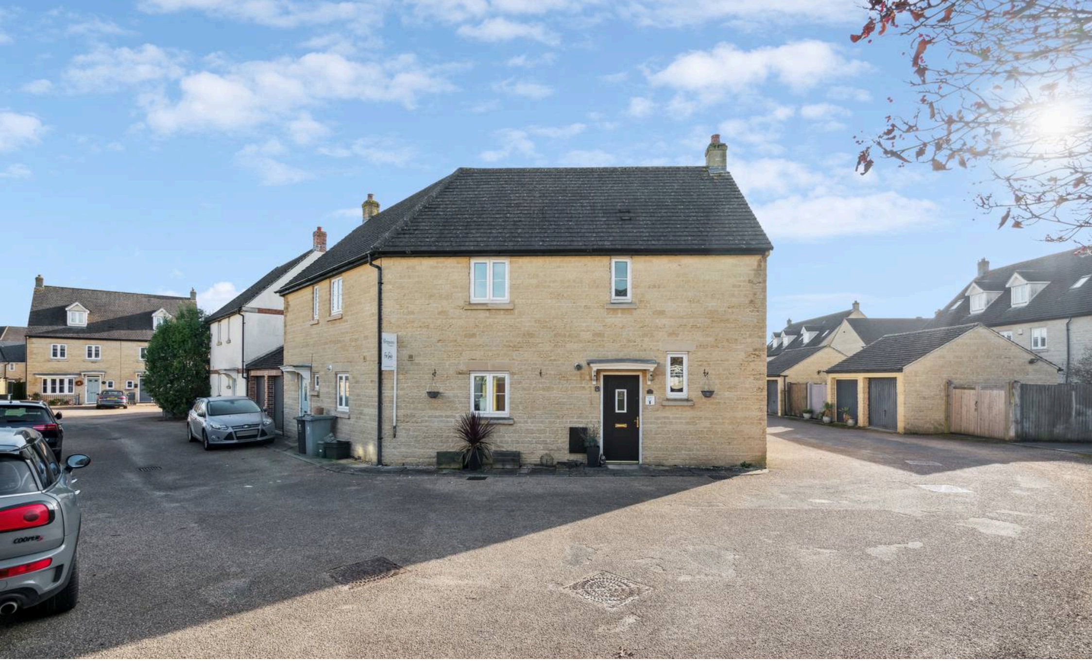
17 Lupin Lane, Carterton