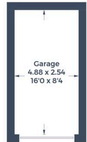
(Not Shown In Actual Location / Orientation)

This plan is for layout guidance only. Not drawn to scale unless stated. Windows and door openings are approximate. Whilst every care is taken in the preparation of this plan, please check all dimensions, shapes and compass bearings before making any decisions reliant upon them.