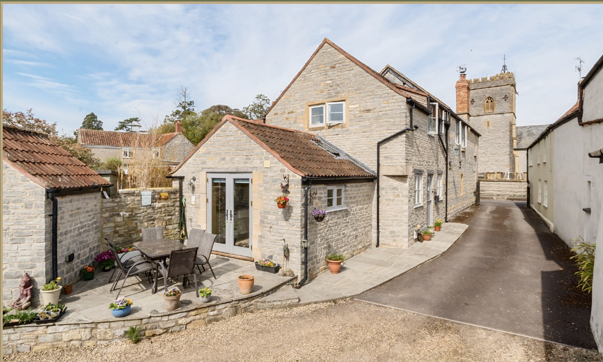
CHURCH FARM HOUSE, CHURCH STREET, DRAYTON, LANGPORT, SOMERSET, TA10 OJY