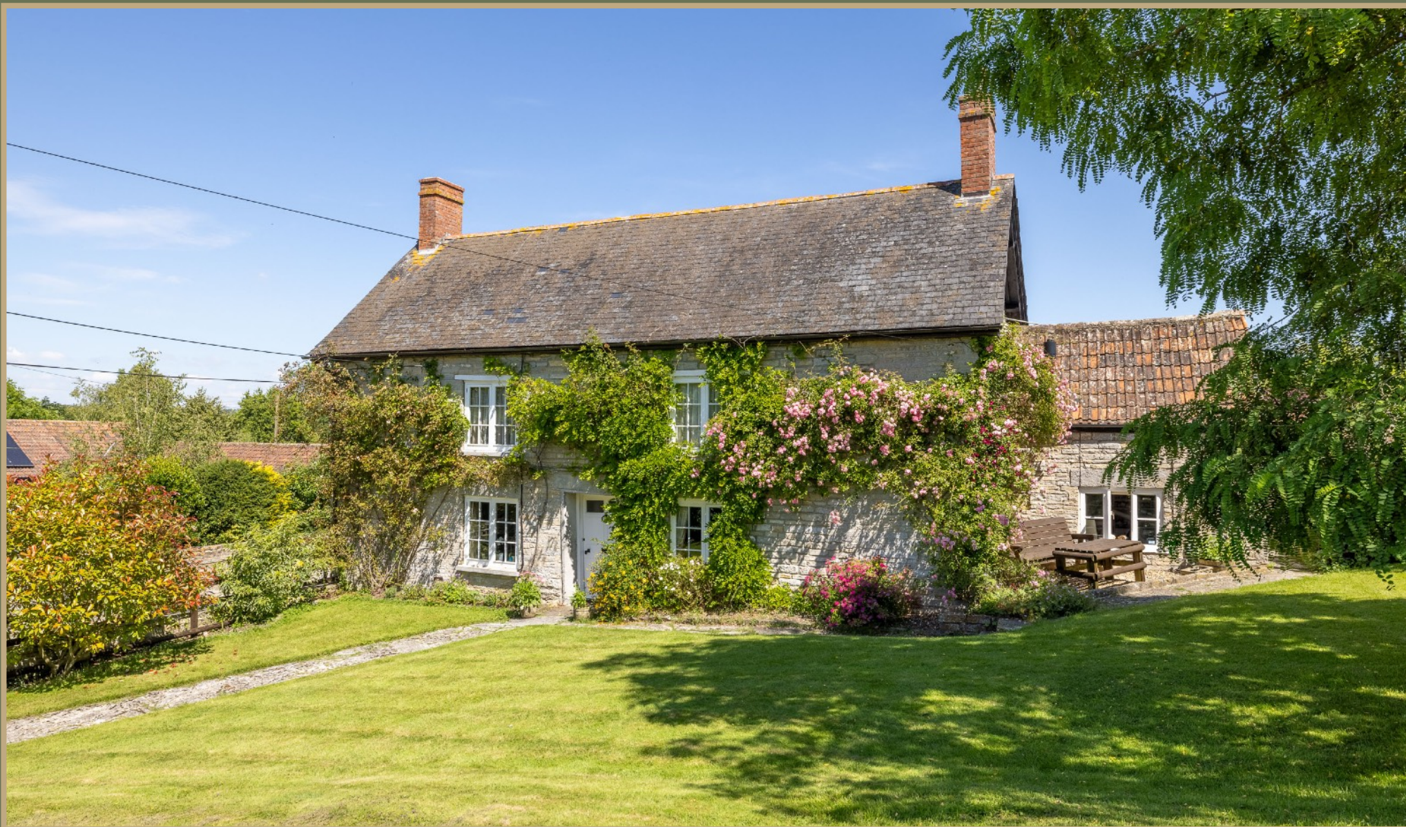
LOWER KNOLE FARM, KNOLE, LANGPORT, SOMERSET, TA10 9HZ