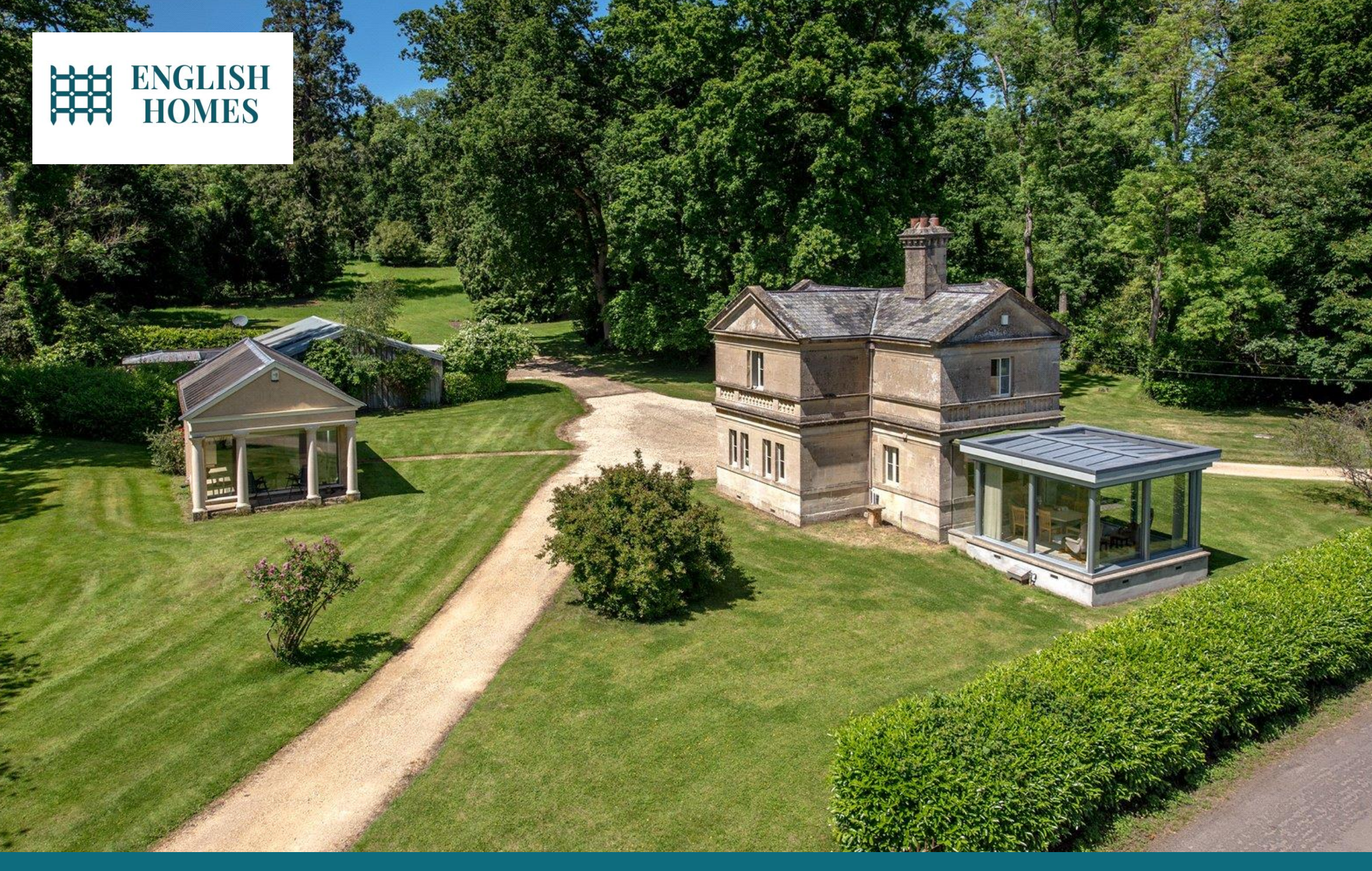
Hatch Beauchamp, Taunton, Somerset, TA3