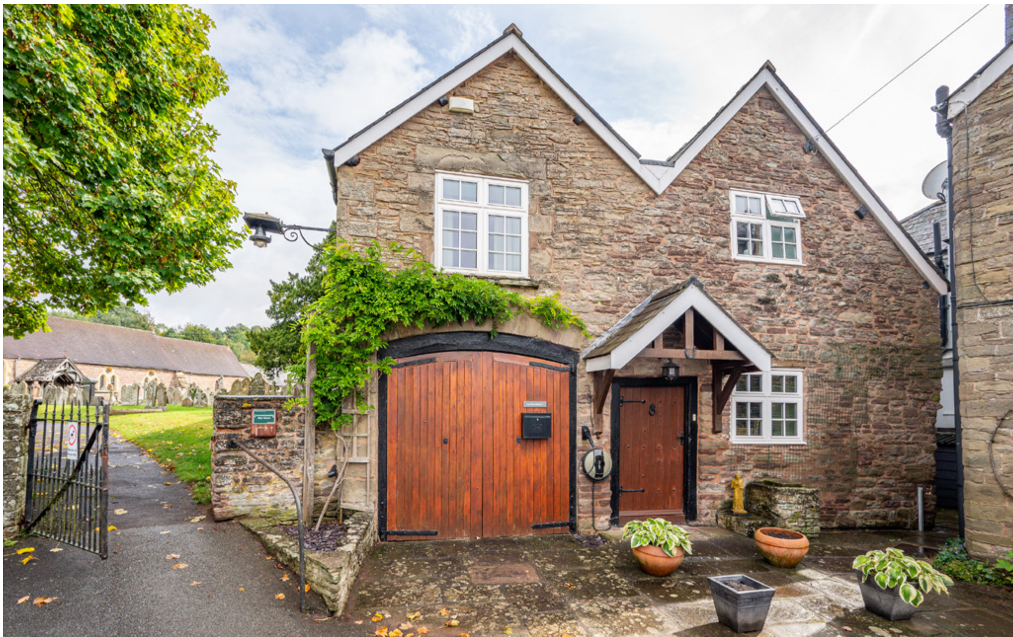
Monks Retreat Ewyas Harold | Hereford | Herefordshire | HR2 0EX