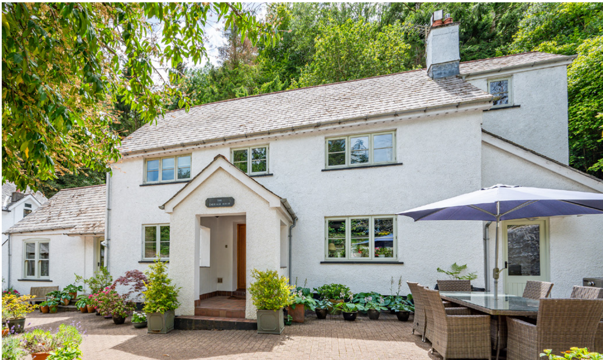
The Carriage House Merthyr Road | Llanfoist | Abergavenny | NP7 9LR