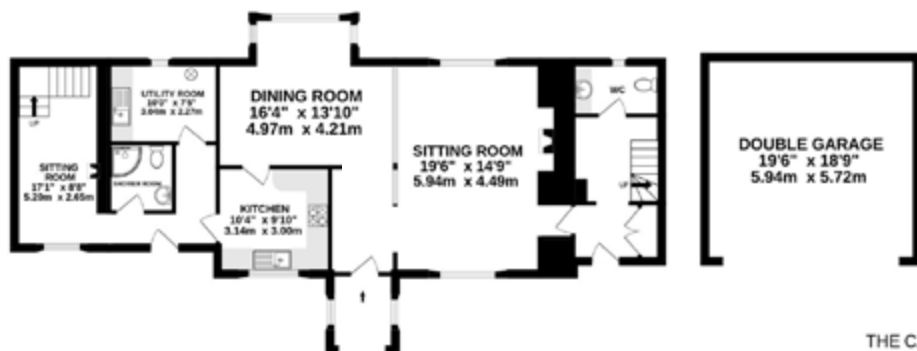
GROUND FLOOR 1494 sq.ft. (138.8 sq.m.) approx.