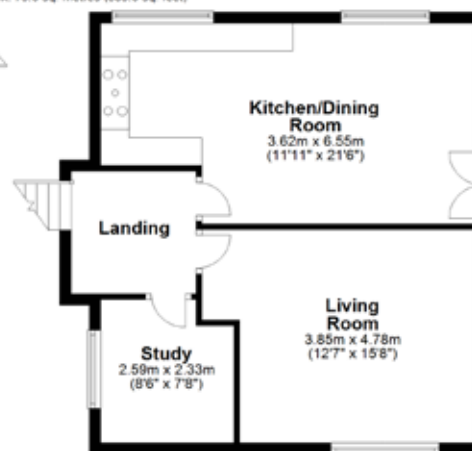
4 Long Orchard