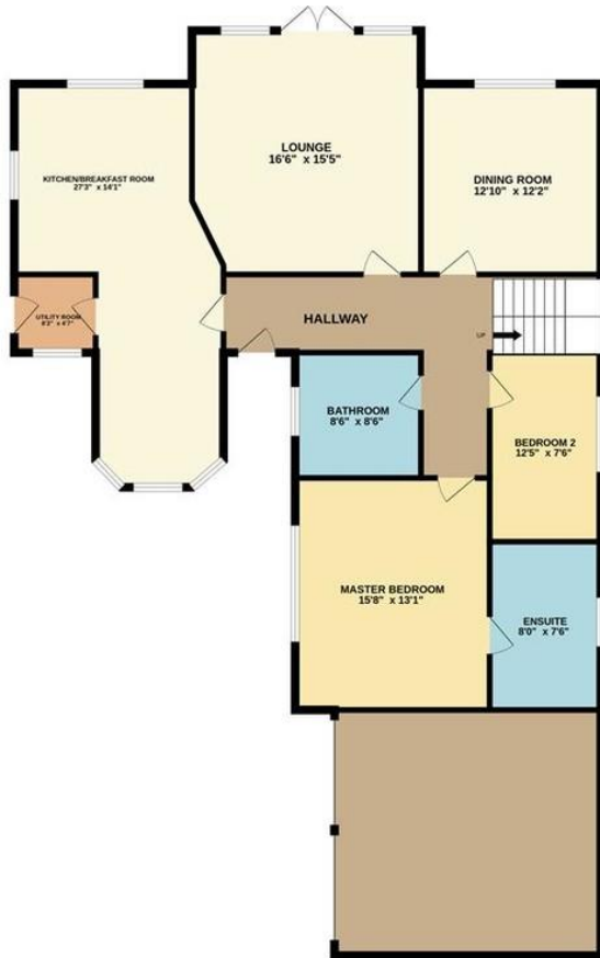
GROUND FLOOR 1645 sq.ft. approx.