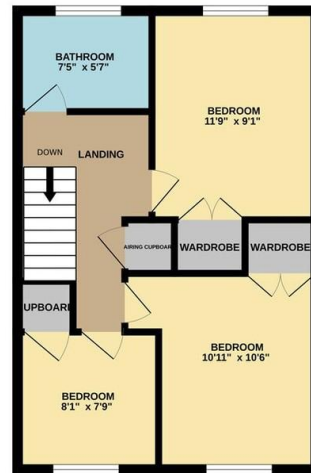
1ST FLOOR 423 sq.ft. approx.