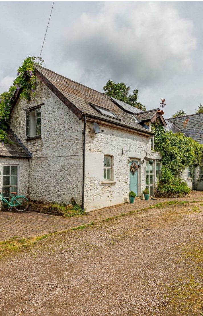
The Old Granary, Rudry, Caerphilly Approximate Gross Internal Area Main House = 3,207 sqft / 298 sq m