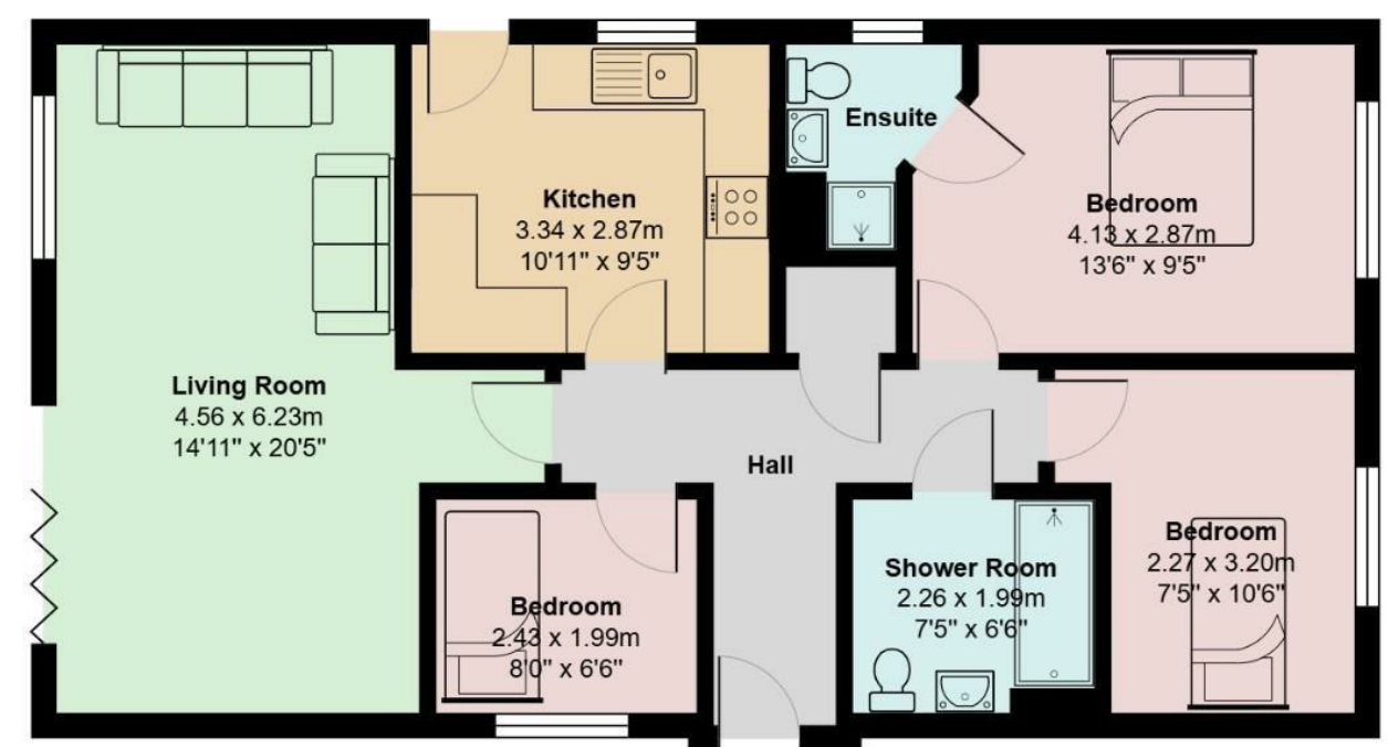
Total Area: 75.6 m 2 ... 814 ft 2

All measurements are approximate and for display purposes only