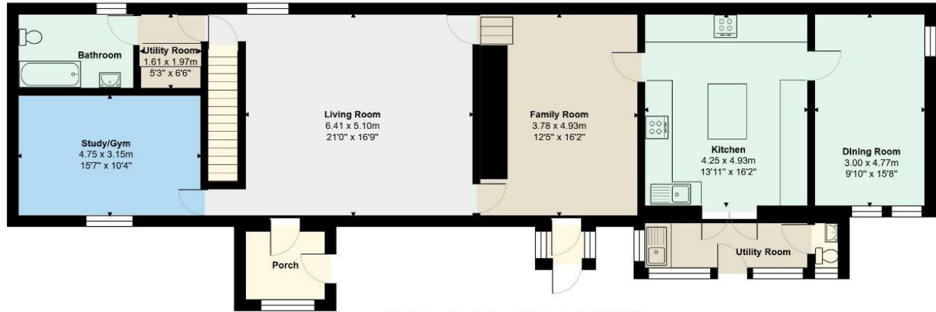
Trehir Farm, Pandy Lane, Llanbradach, CF83 3DZ Total Area: 246.4 m 2 ... 2652 ft 2 All measurements are approximate and for display purposes only