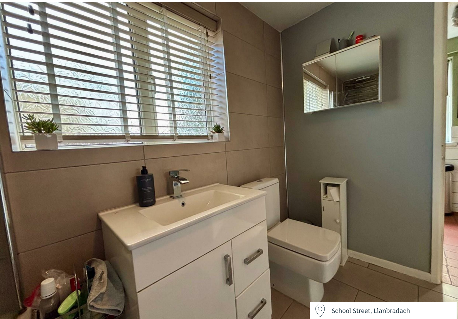
School Street, Llanbradach