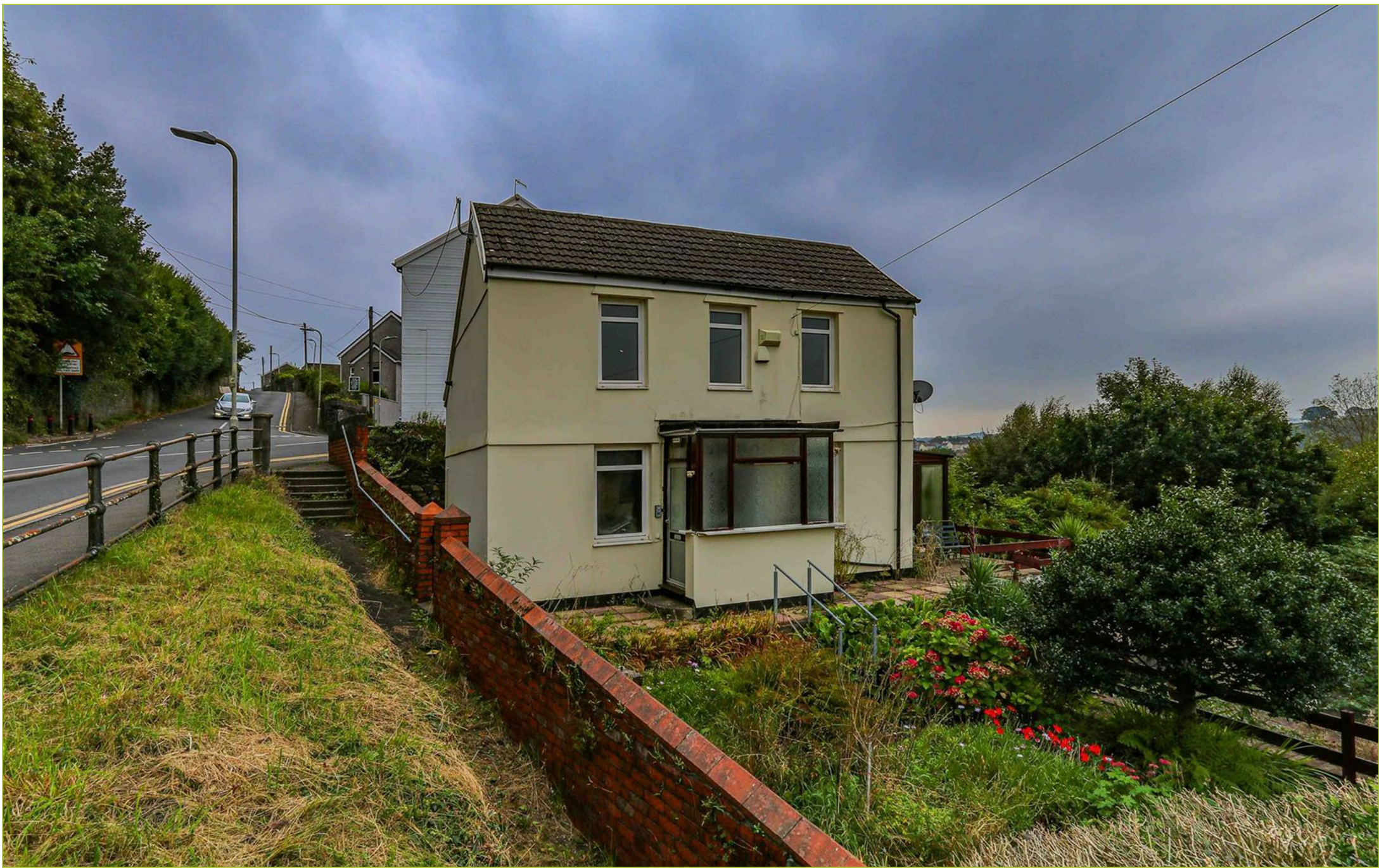
3 Pantanas Cottages, Treharris, CF46 5LP Offers Invited £180,000