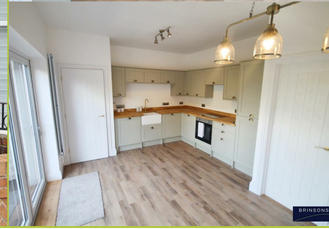
102 Van Road, Caerphilly, CF83 1LD Price £250,000