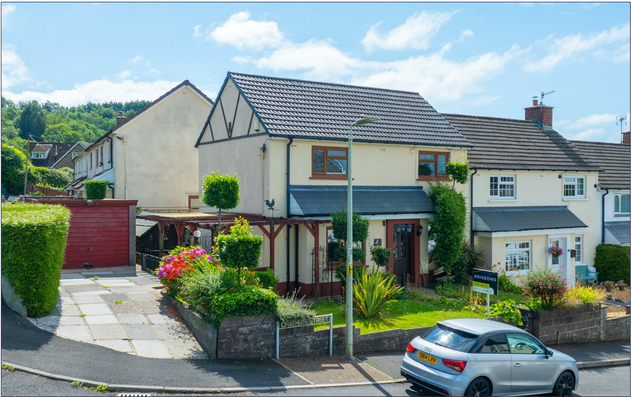
14 Chatham Street, Caerphilly, CF83 8SH Offers Invited £260,000