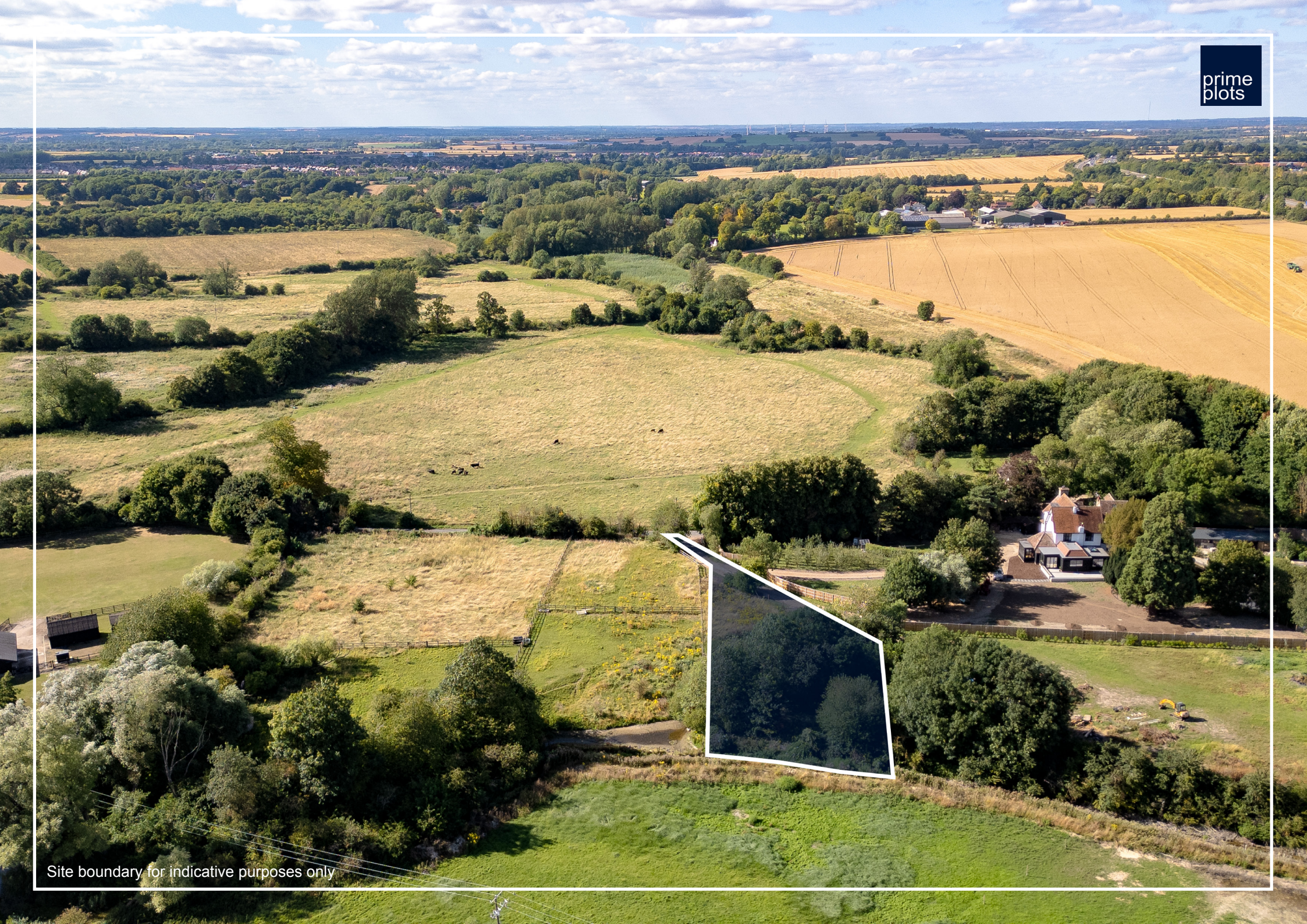
Site boundary for indicative purposes only