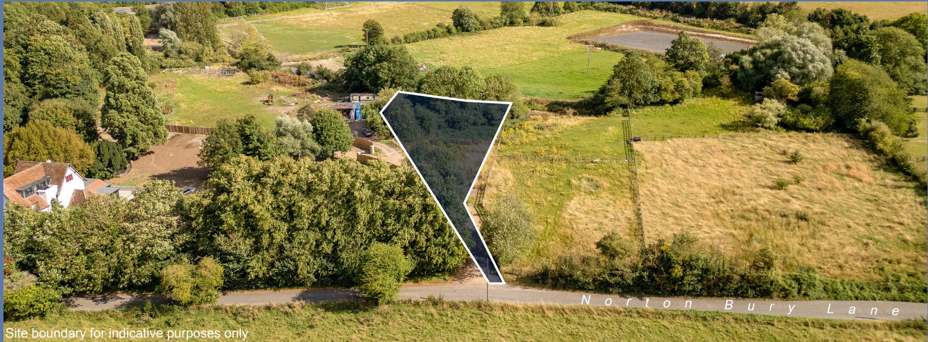
Site boundary for indicative purposes only

Land at Norton Bury Lane Letchworth Garden City Hertfordshire SG6 1AN