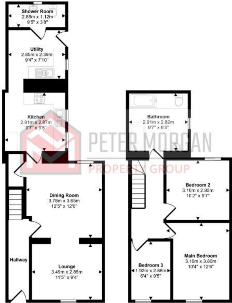
Ground Floor Approx 55 sq m / 587 sq ft

Approx Gross Internal Area 98 sq m / 1051 sq ft