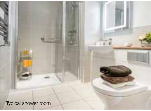
Typical shower room