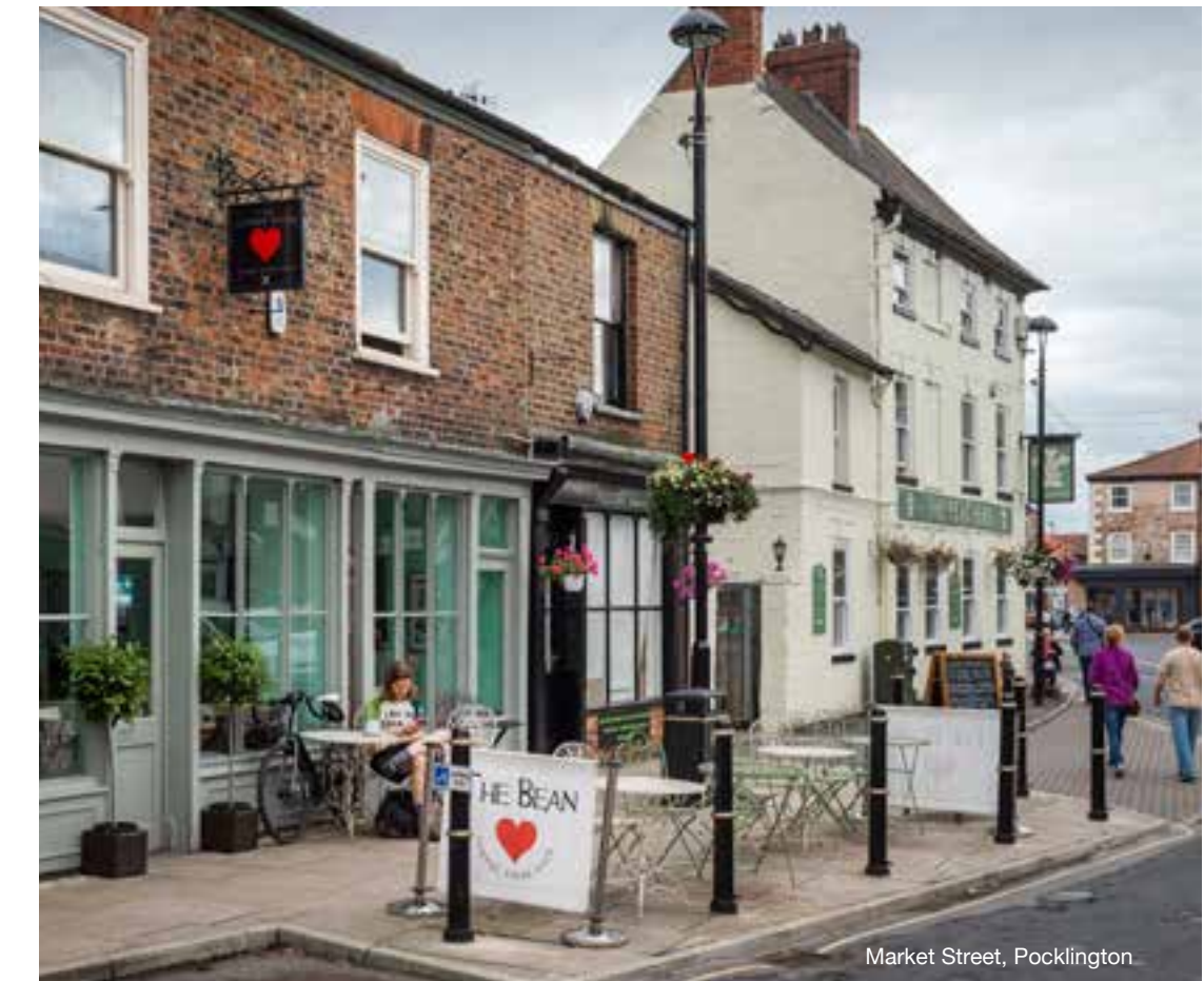
Market Street, Pocklington

At Rogerson Court you can enjoy your beautiful apartment free from the worry of exterior maintenance. Feel safe and secure with a camera entry system linked to your own TV in your apartment and emergency call points answered 24 hours a day. What's more when you feel like company, the homeowners' lounge is a welcoming space where you can socialise with friends and neighbours.