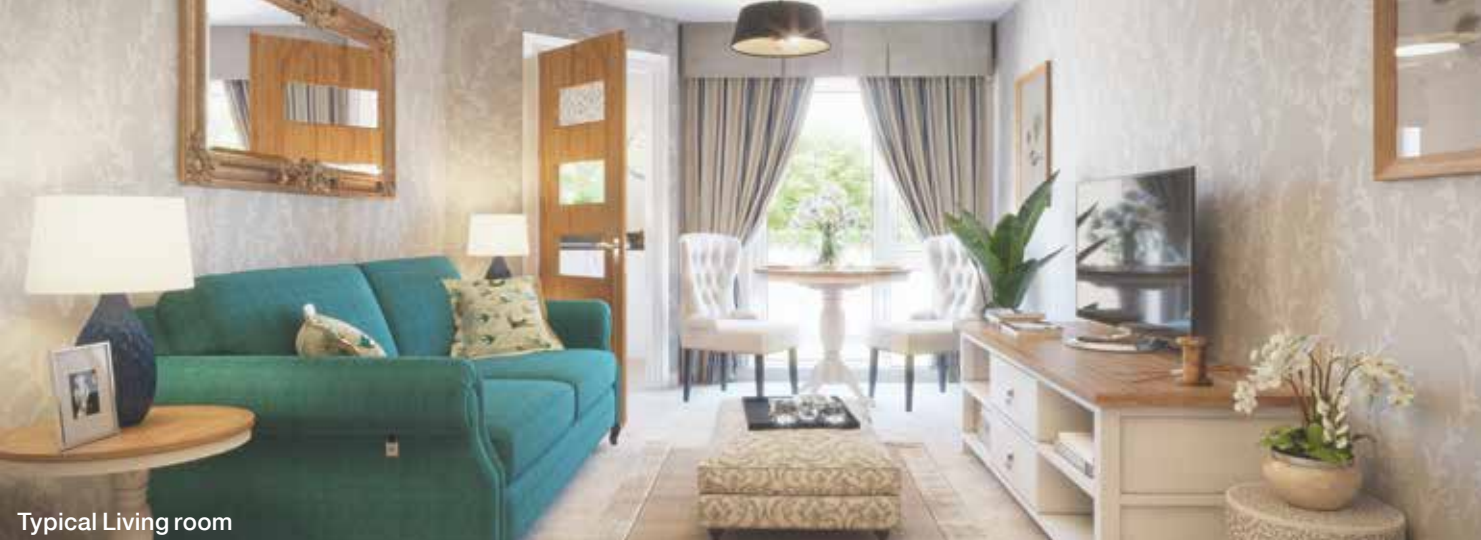
Typical Living room

“Everything is new, so I don’t have to worry about appliances failing or anything else. We no longer have any maintenance worries to think about.”