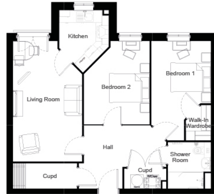
Typical two bedroom apartment