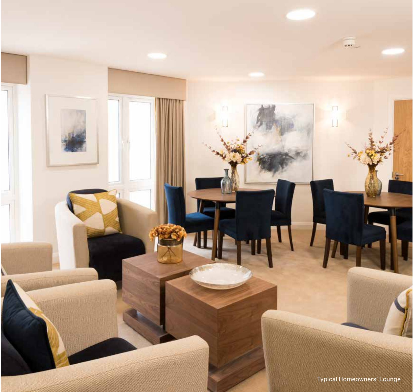
Typical Homeowners' Lounge

Enjoy more time to socialise with the people you care about