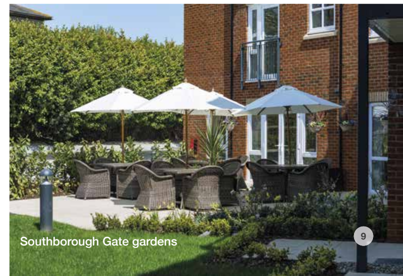
Southborough Gate gardens