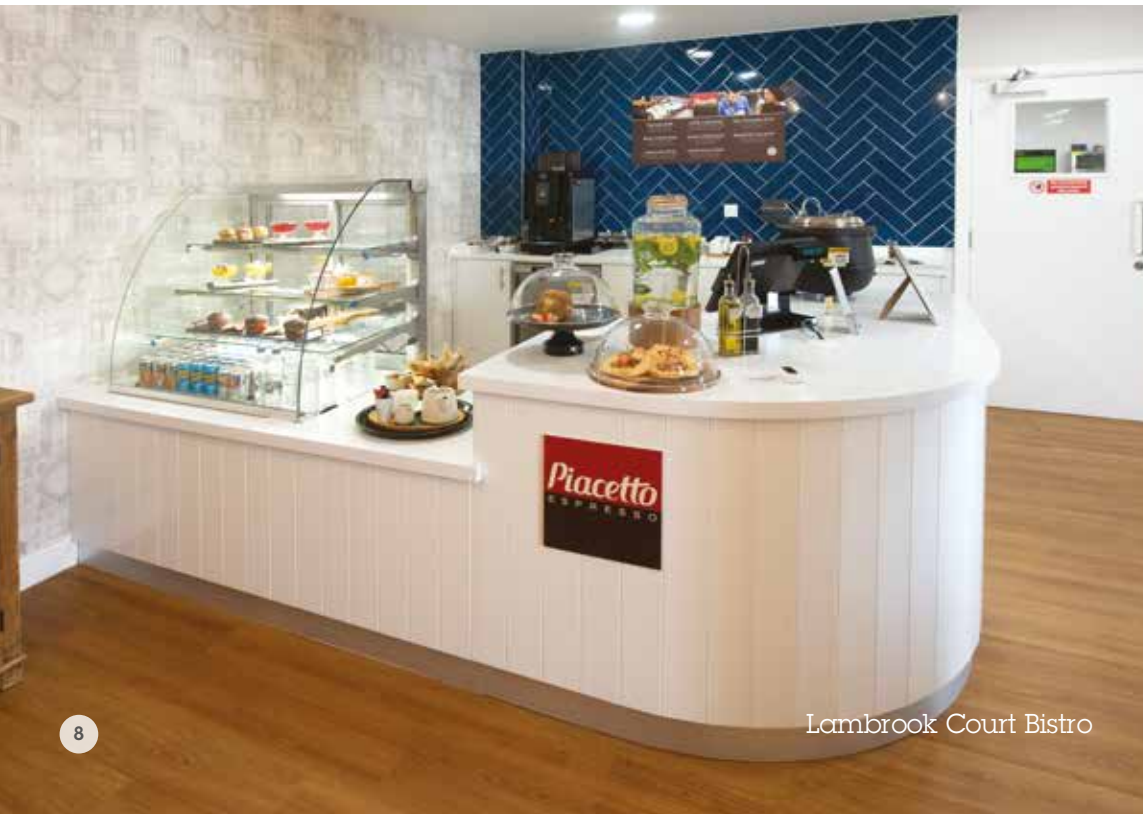
Lambrook Court Bistro

Our bistro style restaurant is a lovely place to meet up with other homeowners and perfect for those days that you don't want to cook for yourself. Serving a variety of light bites and snacks for you and your family and friends, using fresh ingredients and catering for special dietary requirements.