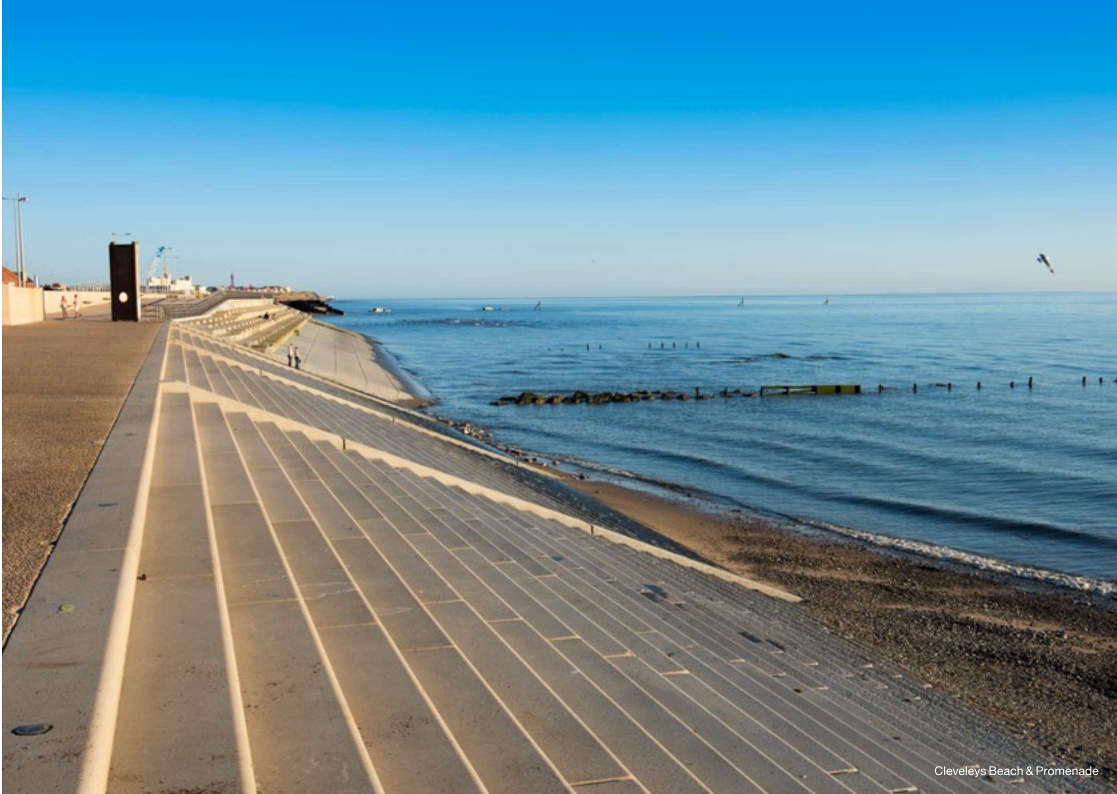
Cleveleys Beach & Promenade

Designed exclusively for the over 60's, our Retirement Living developments give you the best of both worlds. You have the benefit of owning your own home, free from worries about external maintenance or gardening – and there's support if you need help with anything. With so much attention to detail, it's no wonder McCarthy & Stone is the UK's leading retirement housebuilder.