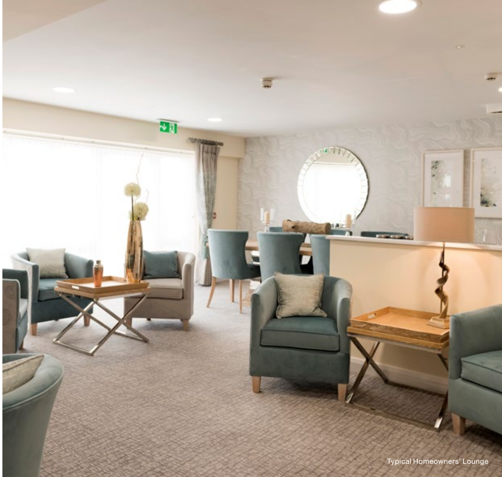
Typical Homeowners' Lounge

Enjoy more time to socialise with the people you care about