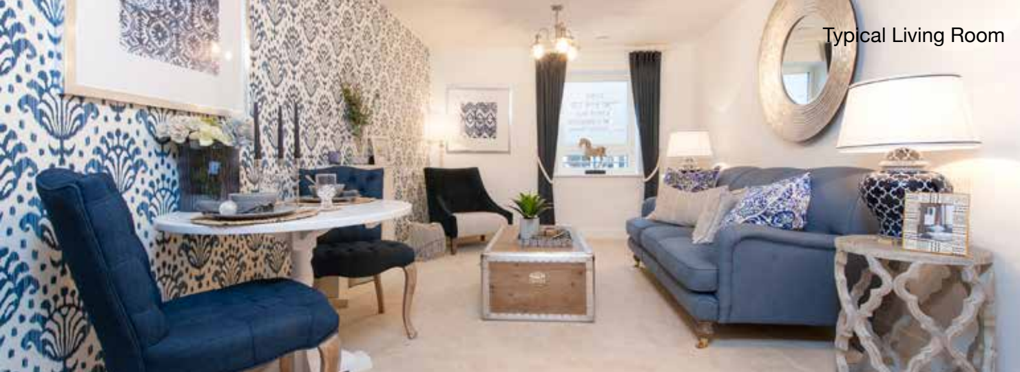
Typical Living Room