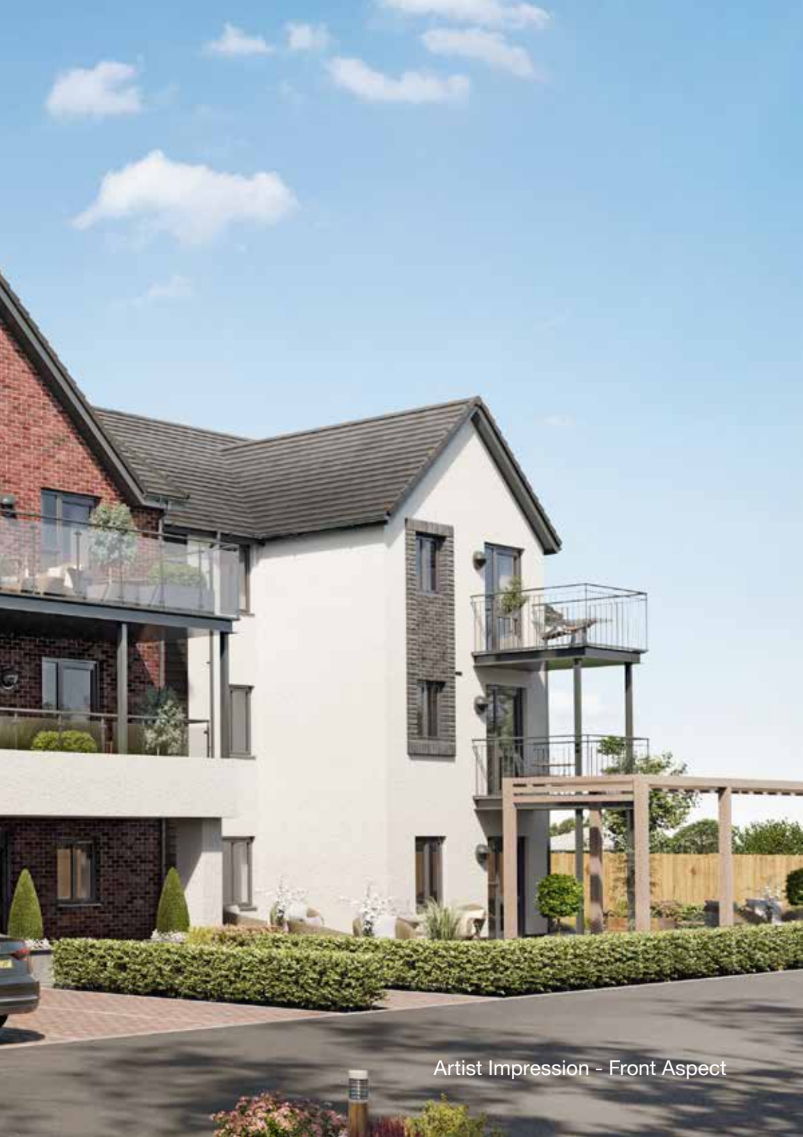
Artist Impression - Front Aspect