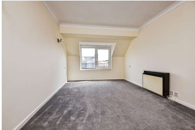
Flat 35 - LA4 6BT