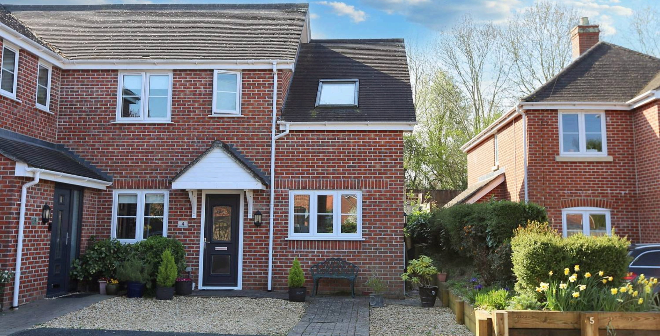
4 Alfred Mews, 39 Spring Lane - SO21 1FA £500,000