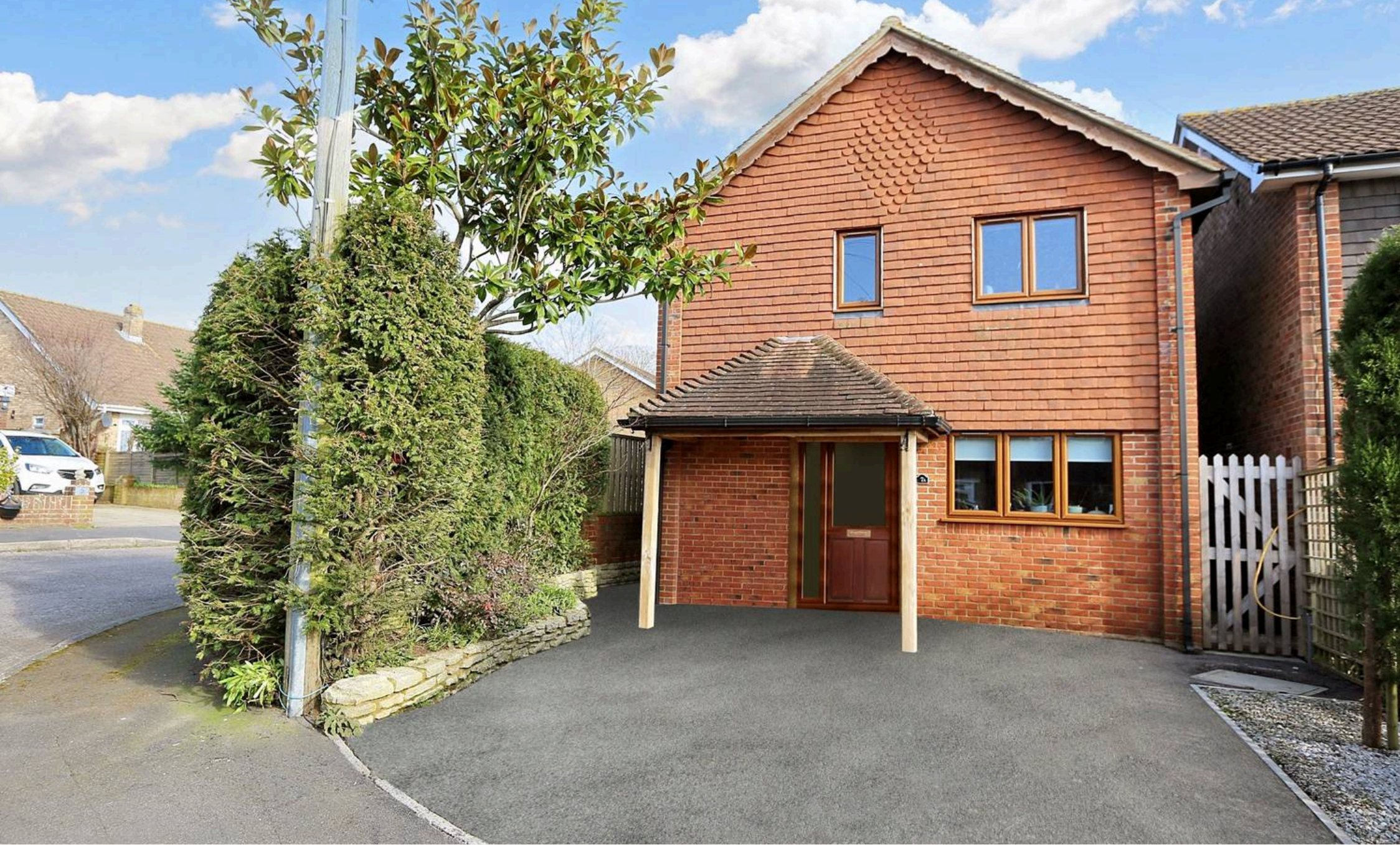
7a Frampton Close, Colden Common - SO21 1SF £400,000