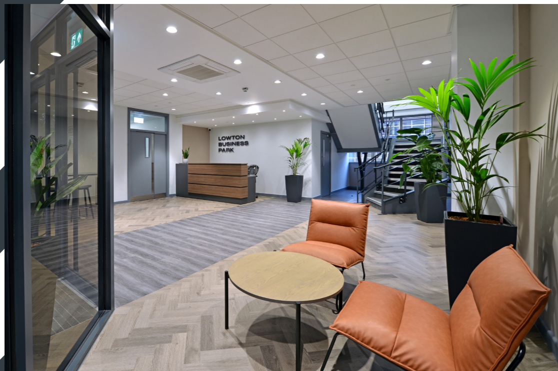
Lowton Business Park Reception Area

The established business park provides brand-new refurbished Grade A workspace, under new professional management, and rebranded to create an exciting destination to start up, grow or relocate your business.