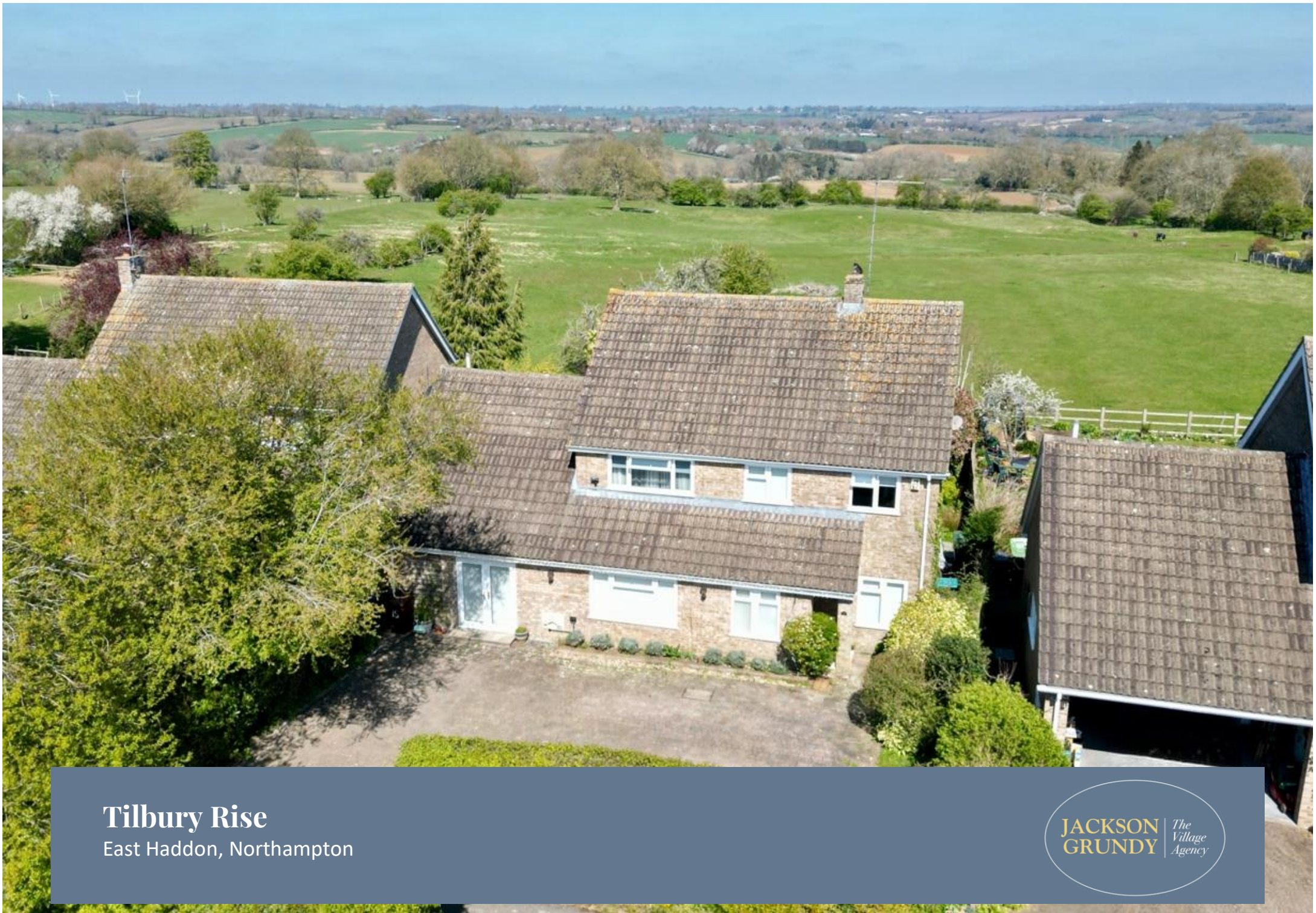
Tilbury Rise East Haddon, Northampton