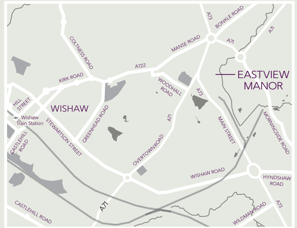
Map not to scale.