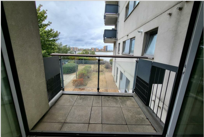
Stylish 2-Bedroom Flat with River Thames Views – Sark Tower, London SE28

Please contact our Garrisons Estate Office on 0203 7001823 if you wish to arrange a viewing appointment for this property or require further information.