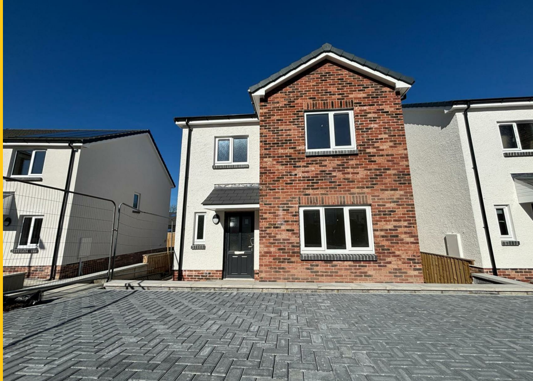
Plot 2 & 3 Clos Gwyn, Tumble, Llanelli, SA14 6AJ

Approximate Gross Internal Area = 118.6 sq m / 1277 sq ft