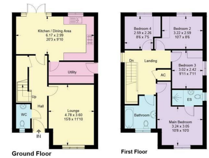
Ground Floor First Floor Illustration for identification purposes only, measurements are approximate, not to scale.

Approximate Gross Internal Area = 118.6 sq m / 1277 sq ft