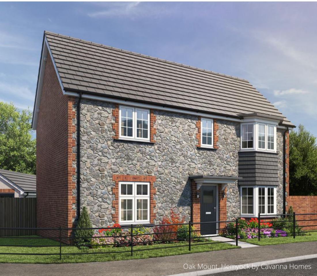
Oak Mount, Hemyock by Cavanna Homes

Cavanna use the finest materials selected for longevity, function and performance. Our attention to detail and quality goes beyond the build, every Cavanna Home comes with contemporary fitted kitchens, the latest heating systems, excellent wall and loft insulation and double glazing as standard. This means your house is thermally efficient, comfortable and beautifully stylish.