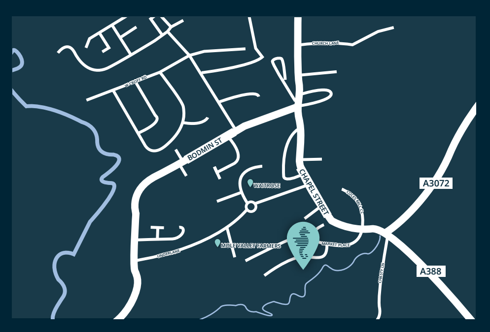
Market Place, Under Lane, Holsworthy, EX22 6BL