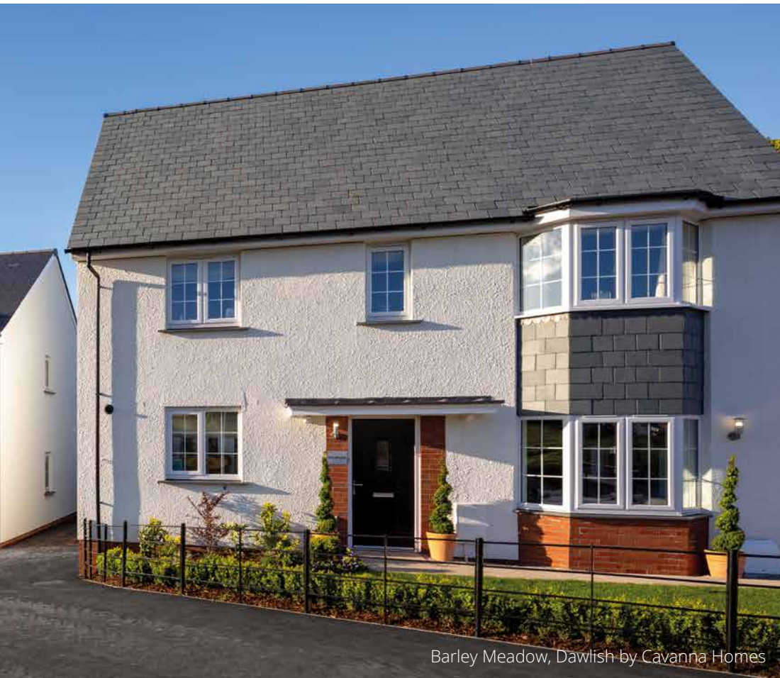
Barley Meadow, Dawlish by Cavanna Homes

Cavanna use the finest materials selected for longevity, function and performance. Our attention to detail and quality goes beyond the build, every Cavanna Home comes with contemporary fitted kitchens, the latest heating systems, excellent wall and loft insulation and double glazing as standard. This means your house is thermally efficient, comfortable and beautifully stylish.