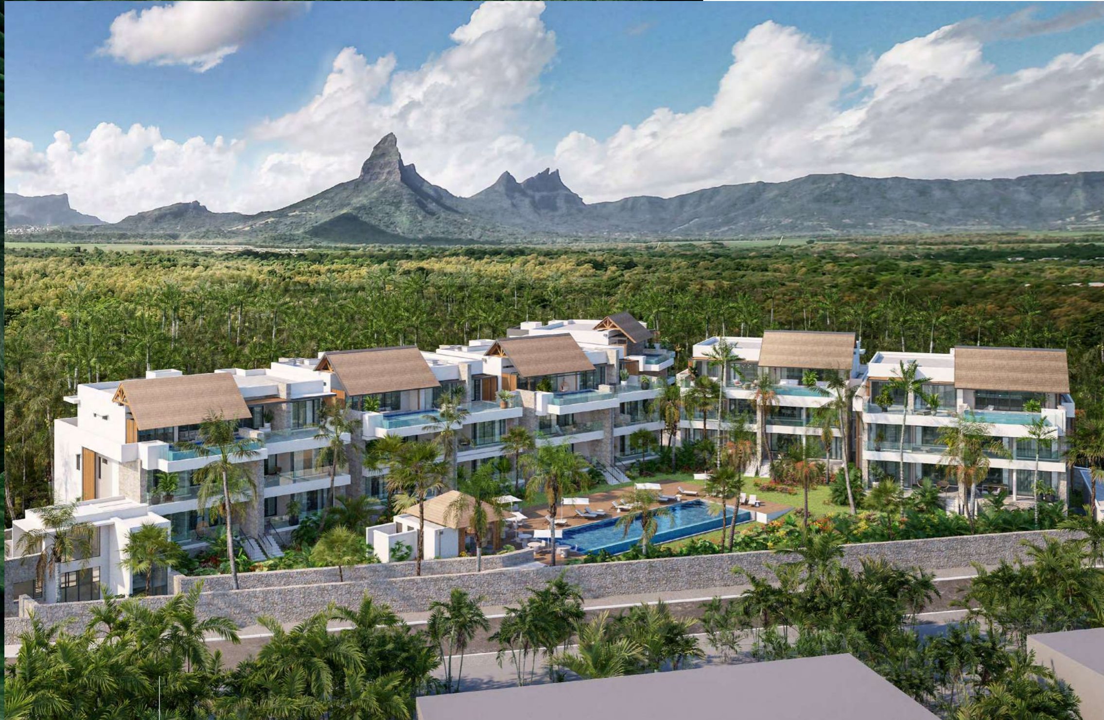
Aerial view of the 6 penthouses