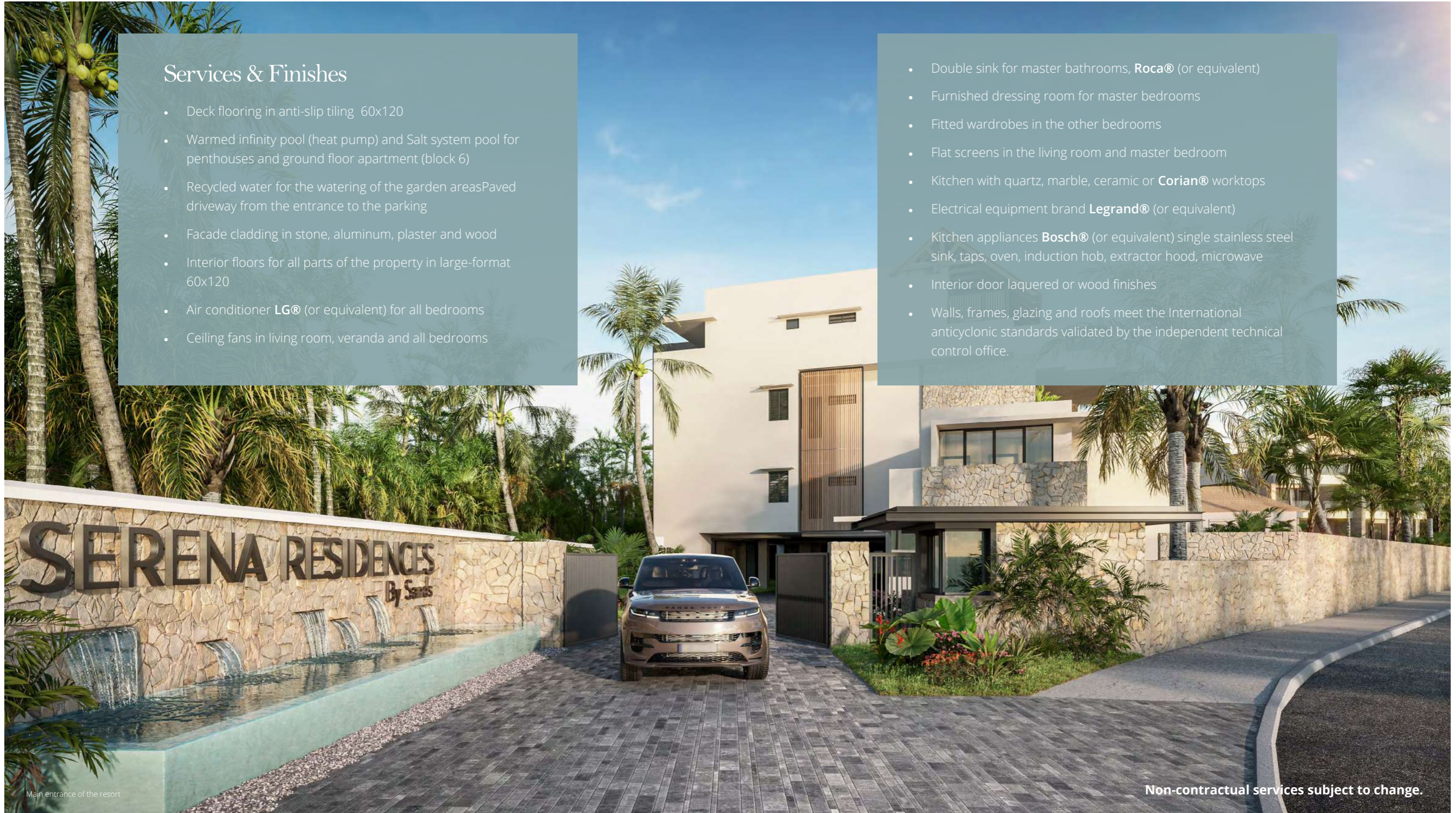
Main entrance of the resort

Non-contractual services subject to change.