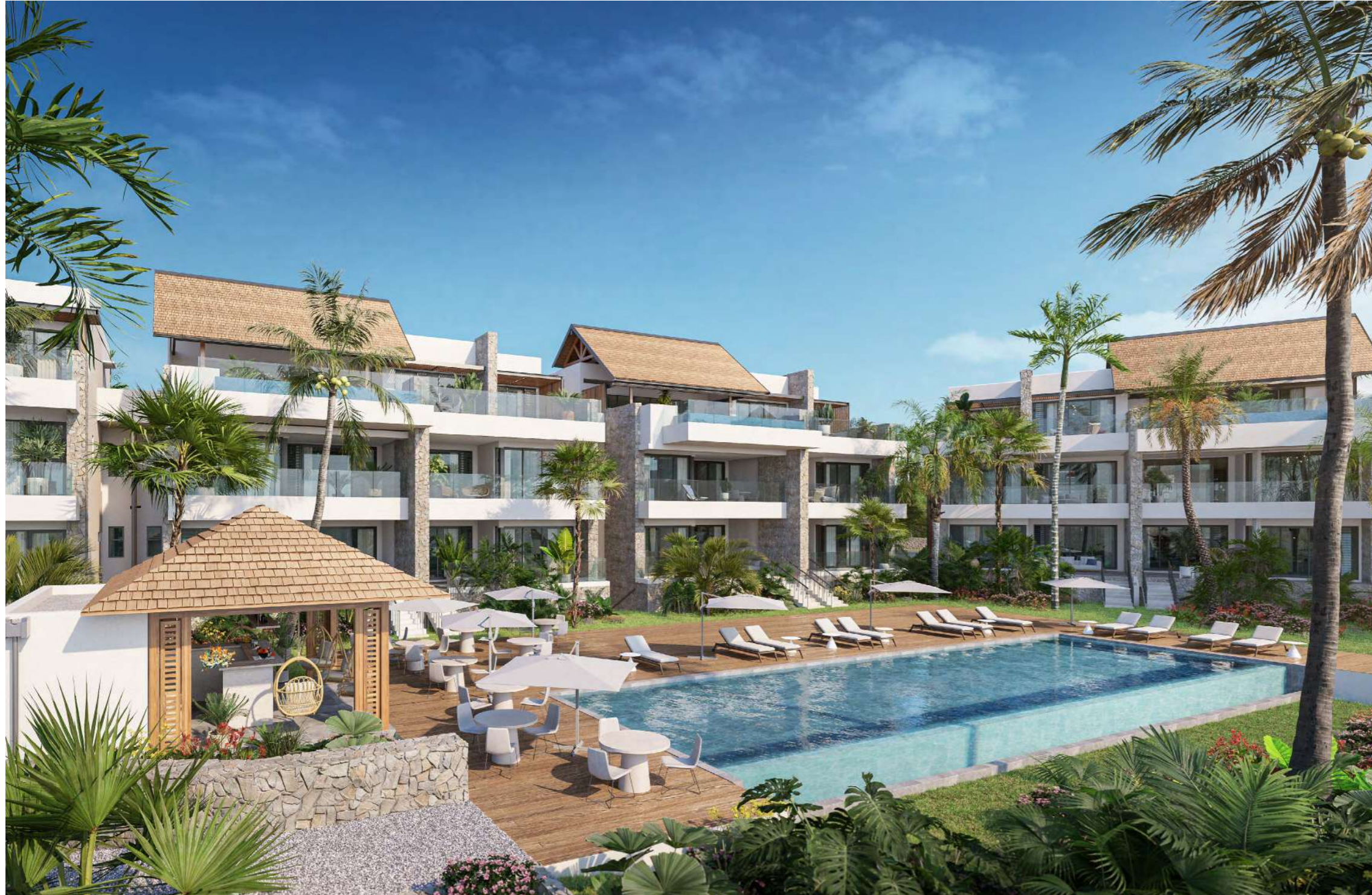
Serena Residences by Sands, main pool and pool bar