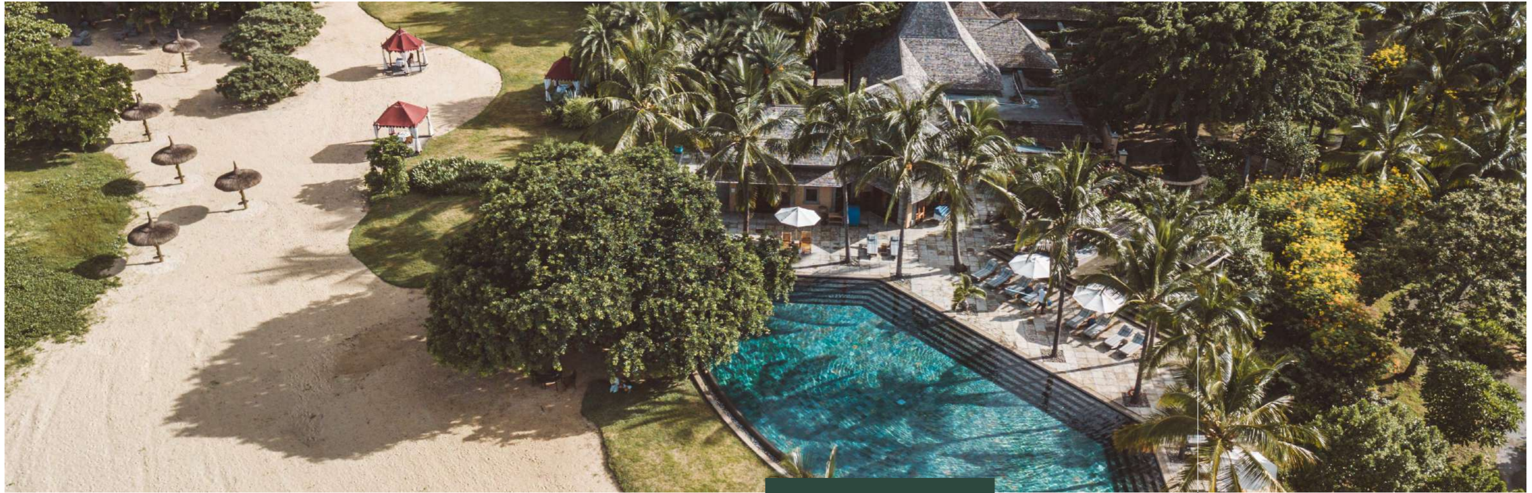
Shared and warmed swimming pool of Maradiva Villas, Resort and Spa.