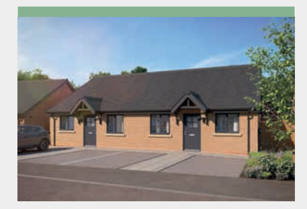
The Foundryman<sup>Lij</sup> 2 bedroom home Plots 101, 102, 103, 104, 105, 106, 107, 108, 109, 110, 111 & 112