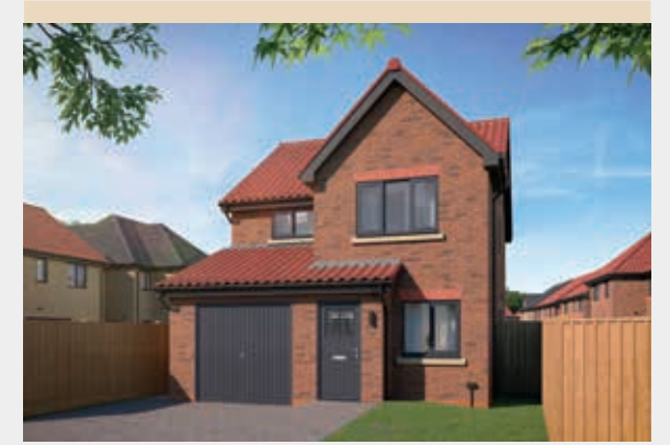
The Sawyer 3 bedroom home Plots 26, 28, 40, 53, 57, 67, 68 & 69