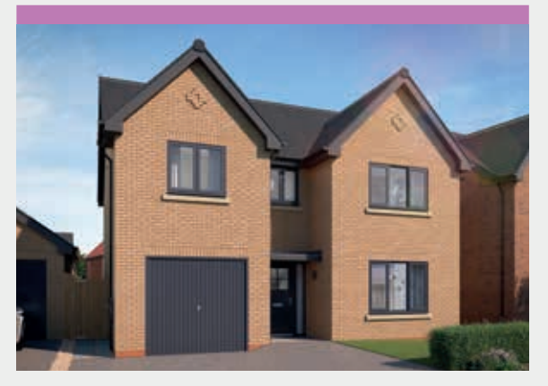
The Lorimer<sup>Lij</sup> 4 bedroom home

Plots 7, 19, 21, 48, 52, 56, 62, 63, 65, 75, 79, 80, 85, 86, 92, 96 & 100