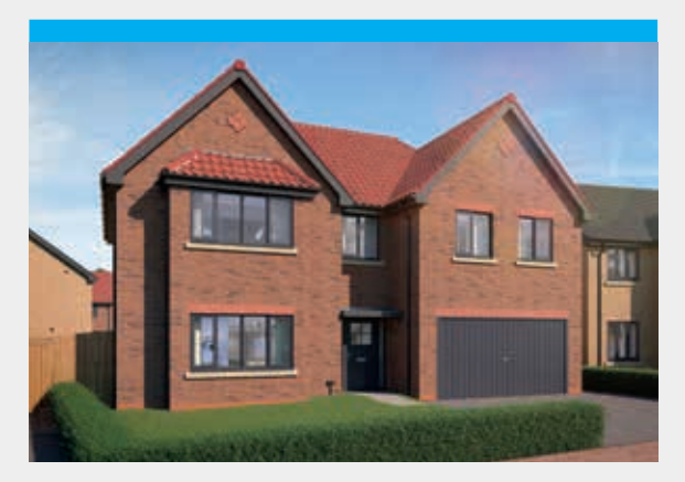
The Draper<sup>Lif</sup> 5 bedroom home Plots 51, 55, 60, 61, 72, 73, 82 & 89

Plots 7, 19, 21, 48, 52, 56, 62, 63, 65, 75, 79, 80, 85, 86, 92, 96 & 100