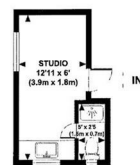
SECOND FLOOR MEZZANINE GROSS INTERNAL FLOOR AREA 86 SQ FT

APPROX. GROSS INTERNAL FLOOR AREA 86 SQ FT / 8 SQ M Floorplans are for identification and guideline purposes only, not to scale. Compliant with RICS code of measuring practice. Floorplans supplied by www.draftingfloorplan.com