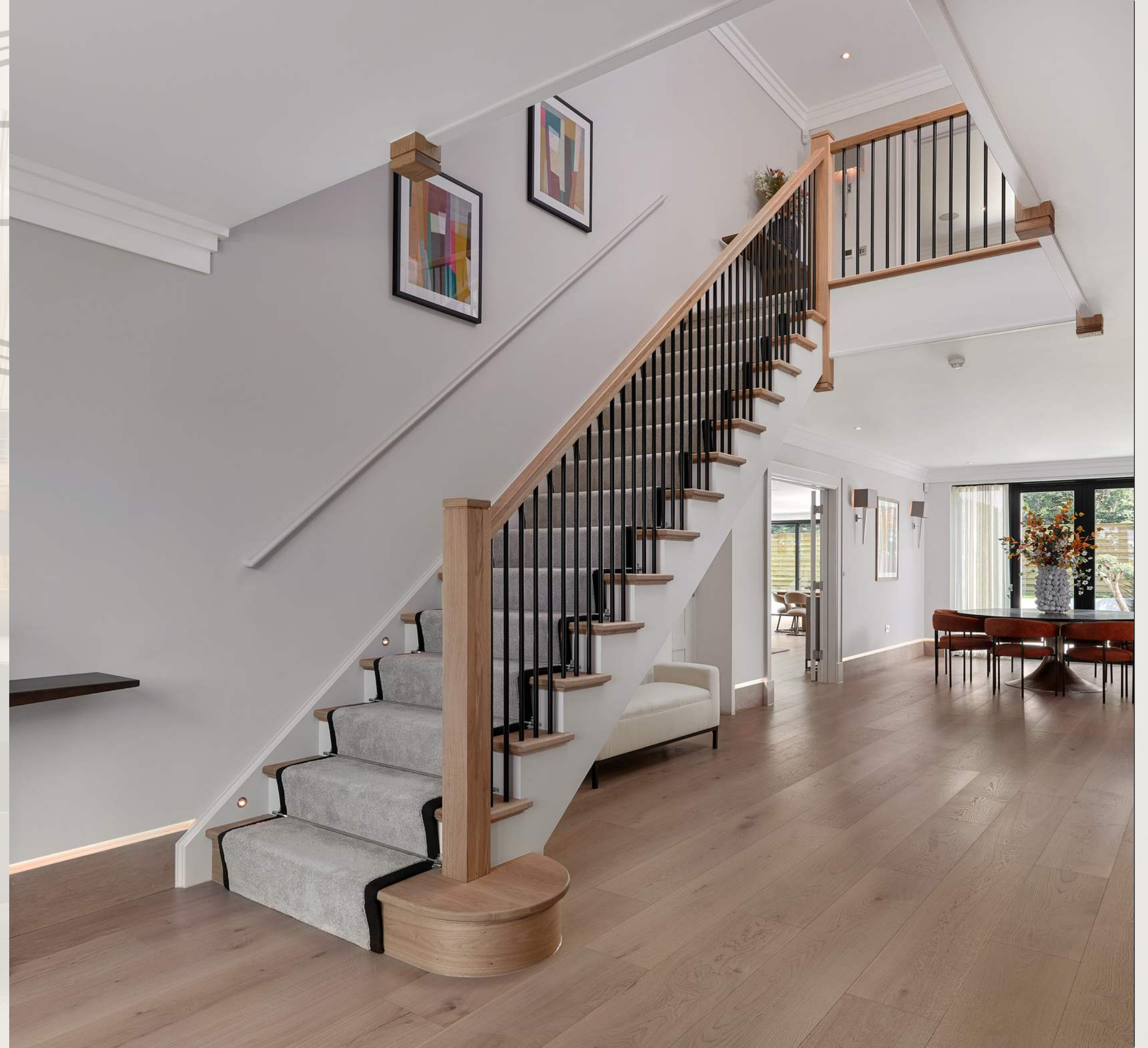
FOUR ACRES, COBHAM