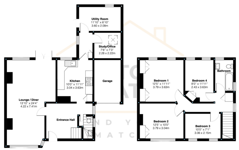
Measurements are approximate and for display purposes only