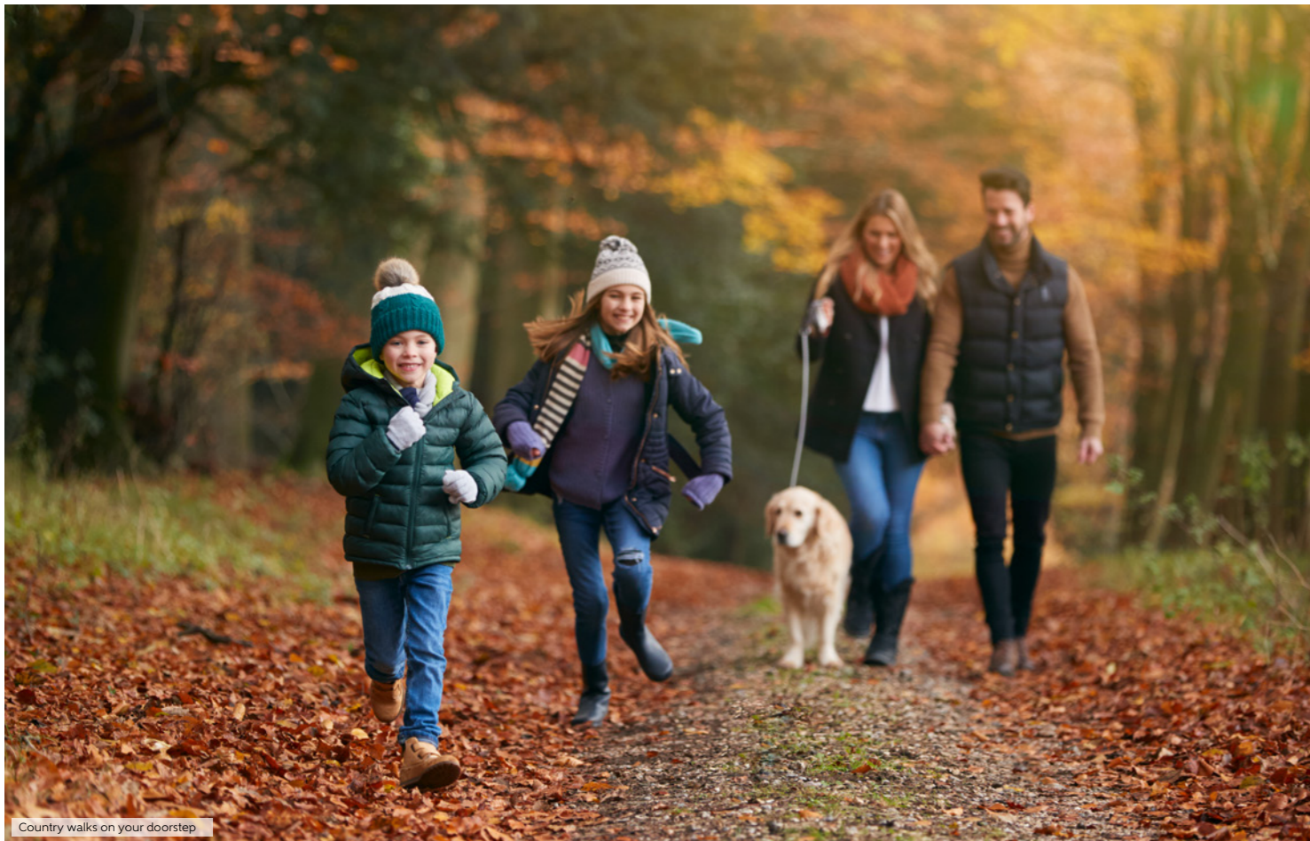
Country walks on your doorstep