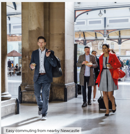
Easy commuting from nearby Newcastle

convenience. The same variety is reflected in the location, which puts a wide range of amenities on your doorstep, along with excellent travel connections to the city and beyond. Such a combination creates the ideal base for first-time buyers, flourishing families and commuting professionals alike.