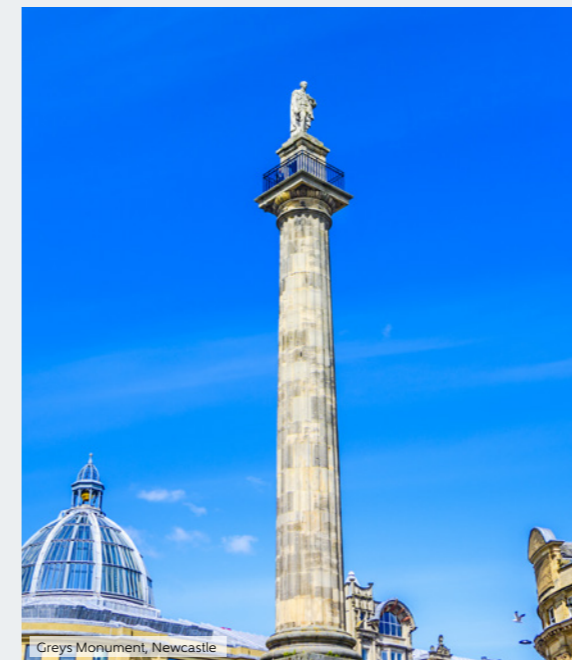
Greys Monument, Newcastle

Alternatively, Benton Metro Station is a three-minute bike ride away and takes you to Newcastle International Airport for trips abroad or Newcastle Central Station where you can easily connect to Edinburgh, London and Manchester by rail.