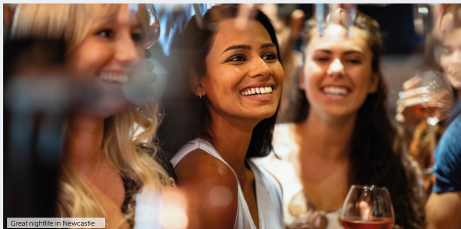
Great nightlife in Newcastle